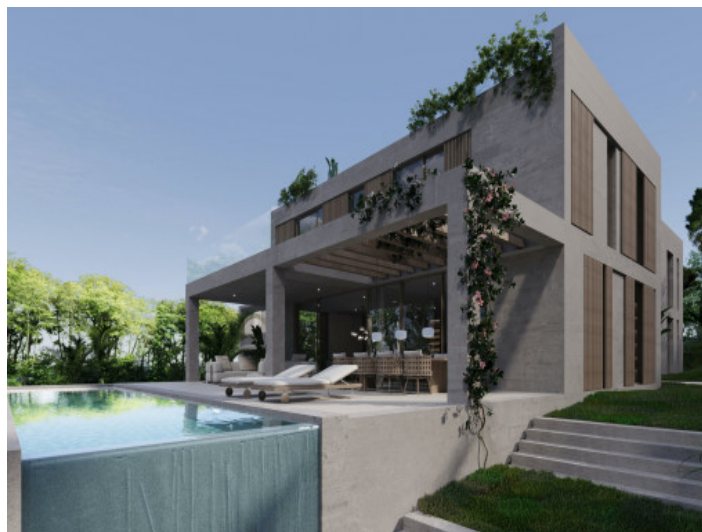
Alternative view of the project