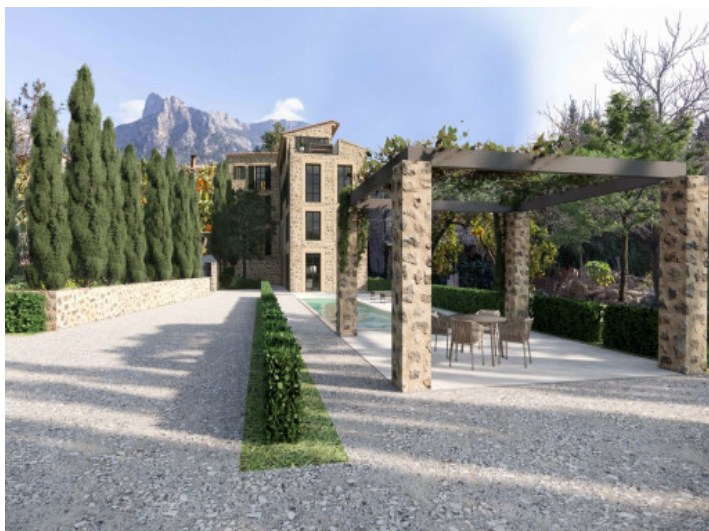
Pool and outdoor area

All information is correct to the best of our knowledge. Errors and prior sale excepted. This prospectus is purely for information purposes. Only the notarized deed of sale is legally binding.