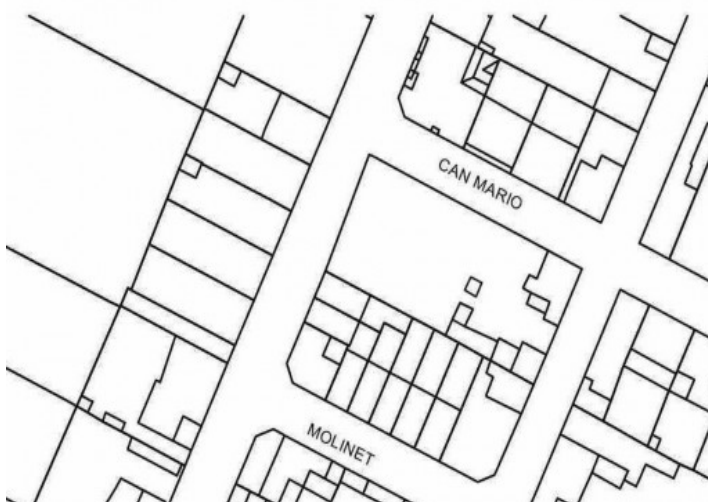
Views to the plot