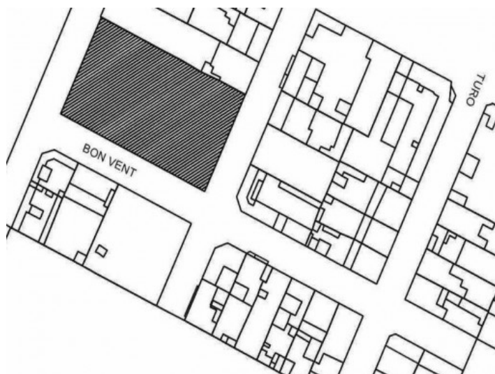
Plan from the plot