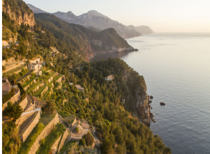
Esportes Coast All information is correct to the best of our knowledge. Errors and prior sale excepted. This prospectus is purely for information purposes. Only the notarized deed of sale is legally binding.