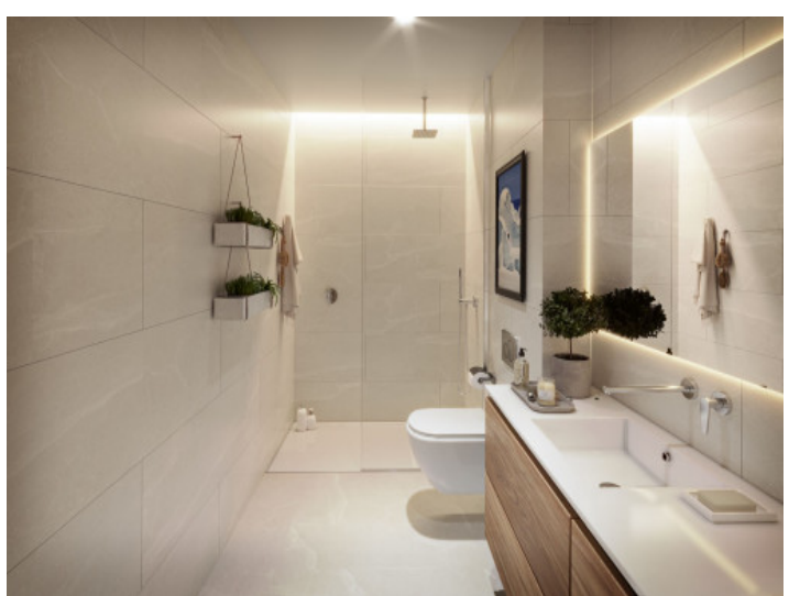
Bathroom Bathroom All information is correct to the best of our knowledge. Errors and prior sale excepted. This prospectus is purely for information purposes. Only the notarized deed of sale is legally binding.