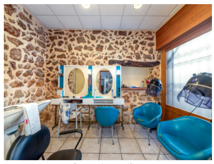
Room on the groundfloor

All information is correct to the best of our knowledge. Errors and prior sale excepted. This prospectus is purely for information purposes. Only the notarized deed of sale is legally binding.