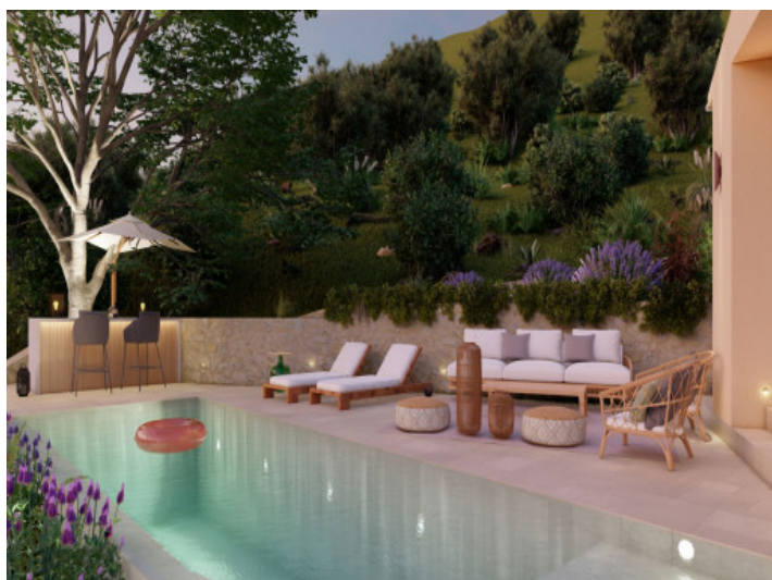
Pool and terrace area