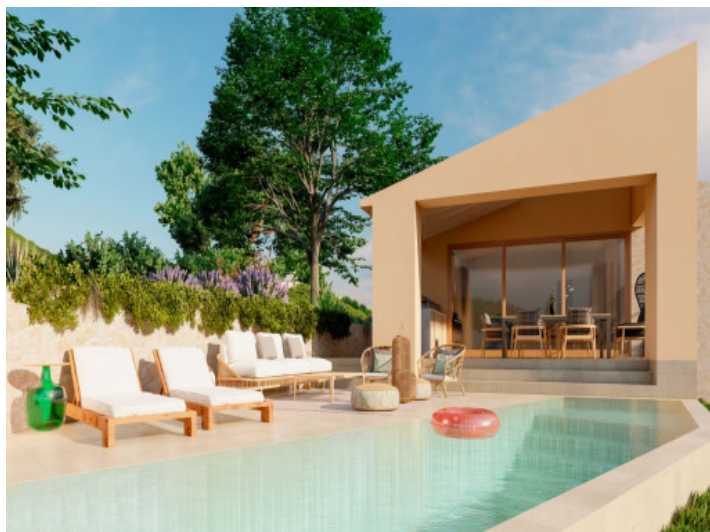
Dreamlike pool area