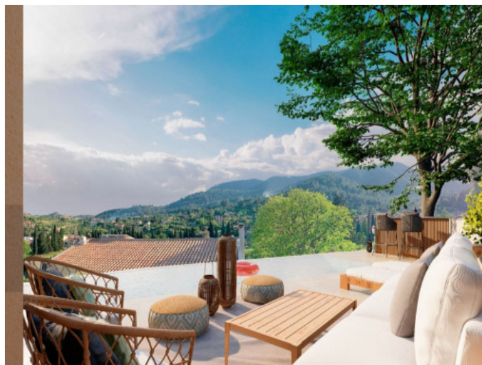
Breathtaking views from the terrace