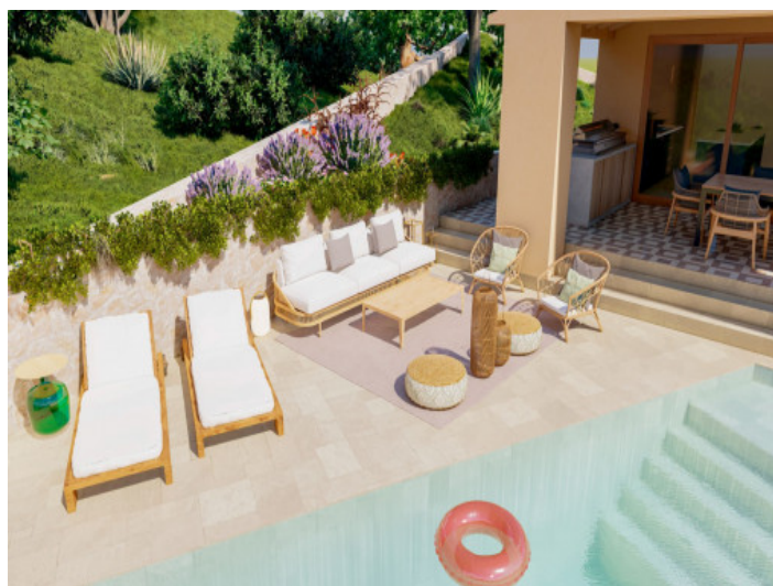
Pool and terrace area