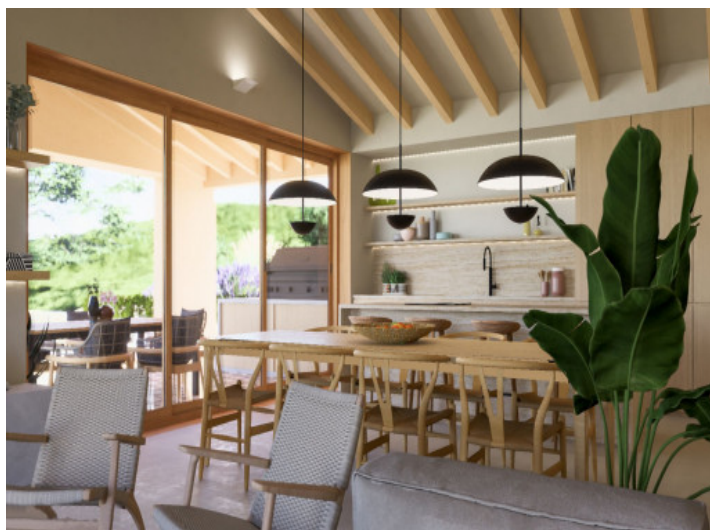
Open dining area and kitchen