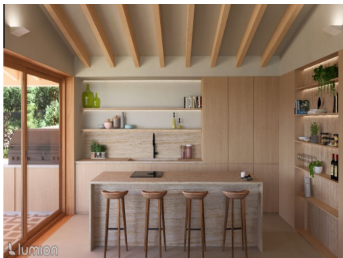
Kitchen with garden views

All information is correct to the best of our knowledge. Errors and prior sale excepted. This prospectus is purely for information purposes. Only the notarized deed of sale is legally binding.