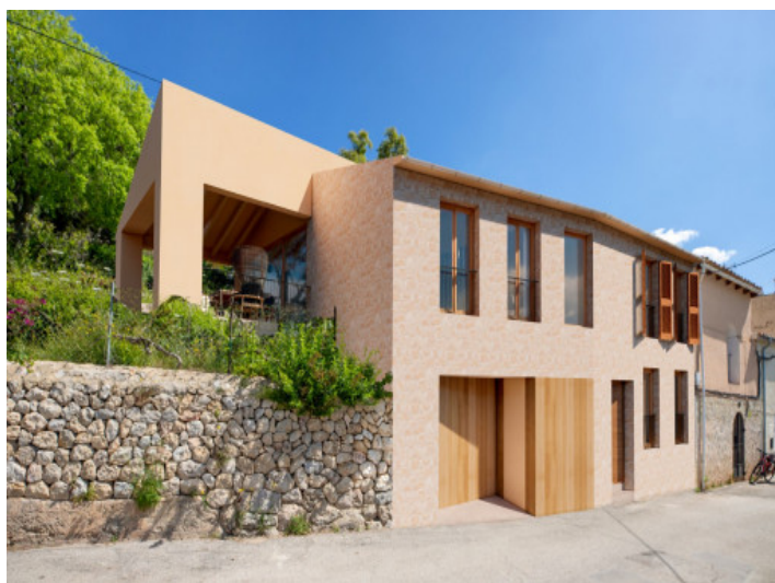
Views from the street to the villa

All information is correct to the best of our knowledge. Errors and prior sale excepted. This prospectus is purely for information purposes. Only the notarized deed of sale is legally binding.