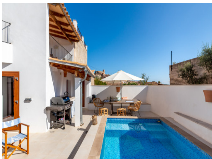
Barbecue area close to the pool