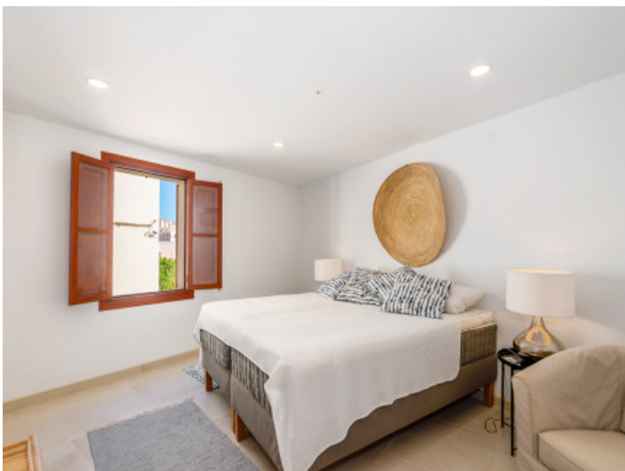
Light flooded bedroom