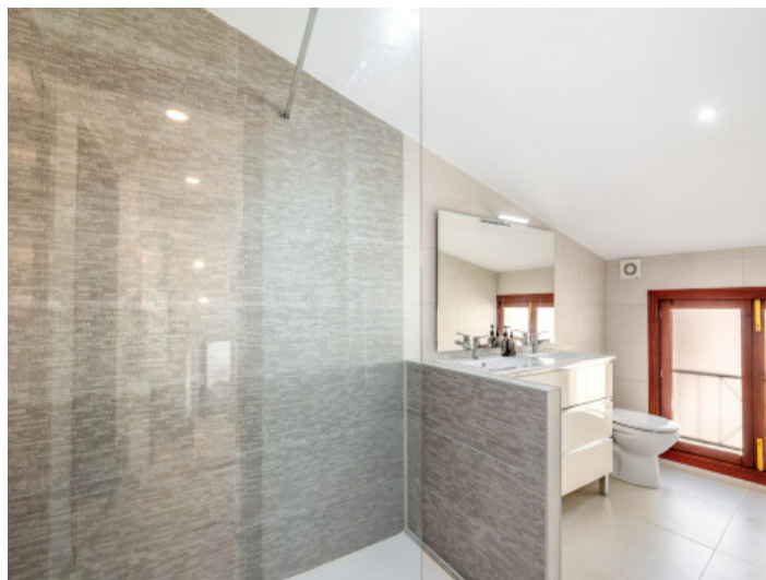
Bathroom with daylight