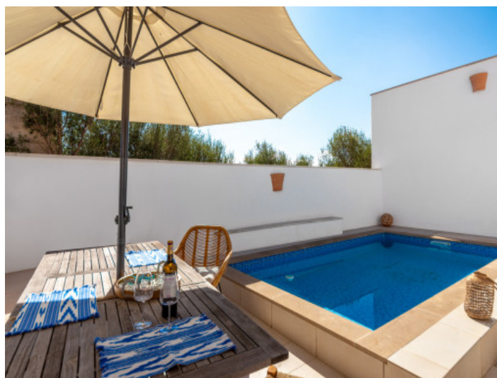
Pool and terrace area invites you to celebrate parties