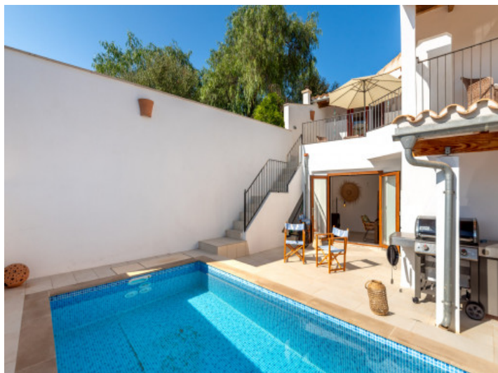
A staircase leads from the terrace area to the balcony area