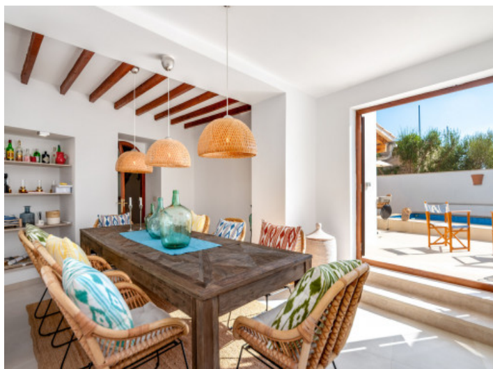
Bright dining area