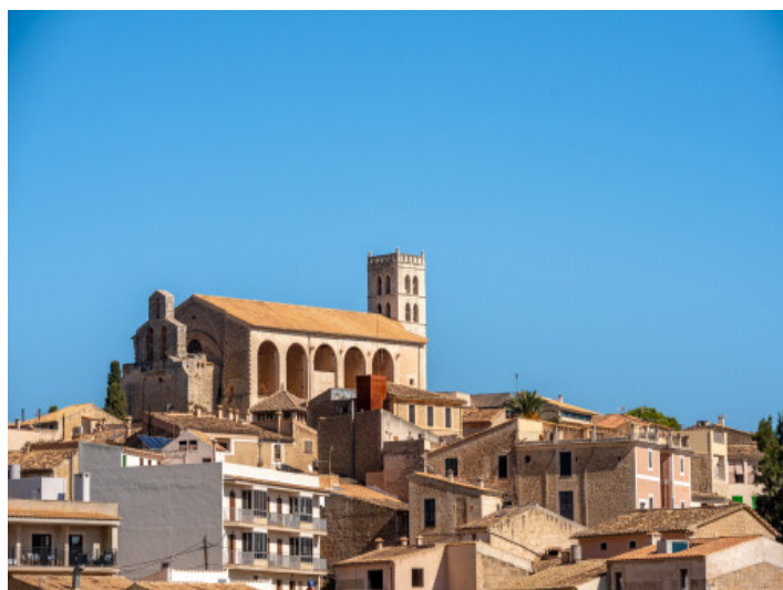
Views to the church from Selva

All information is correct to the best of our knowledge. Errors and prior sale excepted. This prospectus is purely for information purposes. Only the notarized deed of sale is legally binding.