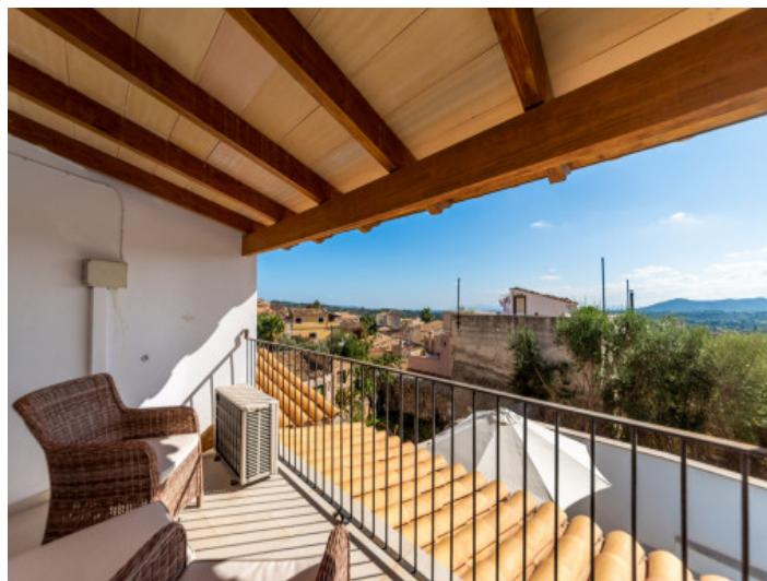
Balcony with landscape views