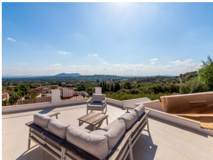
Sunny roof terrace