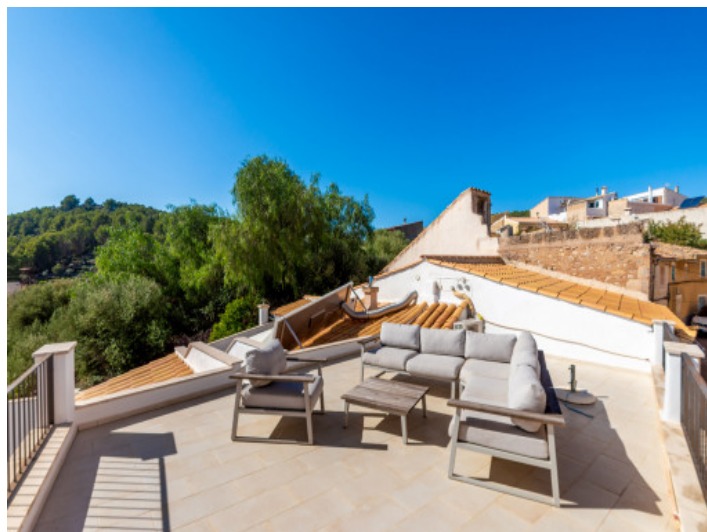
Elegant lounge area