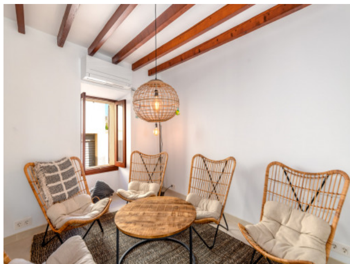
Cosy living area

All information is correct to the best of our knowledge. Errors and prior sale excepted. This prospectus is purely for information purposes. Only the notarized deed of sale is legally binding.