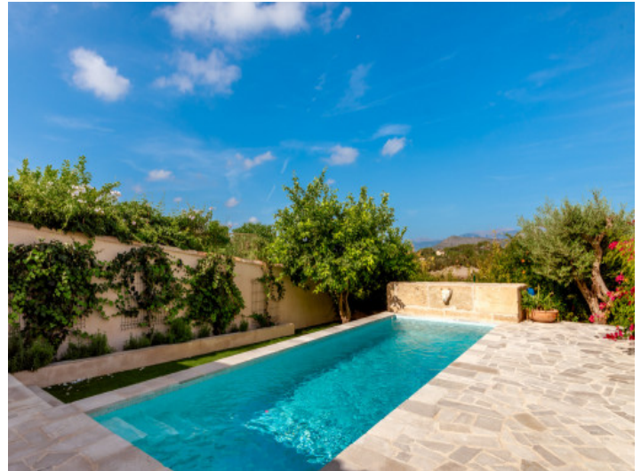
Idyllic pool area