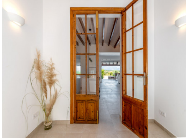
Entrance from the townhouse