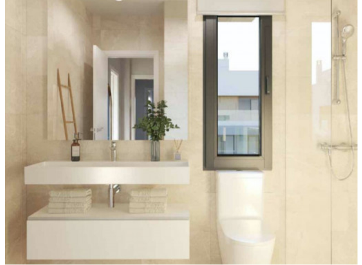
One of 3 bathrooms