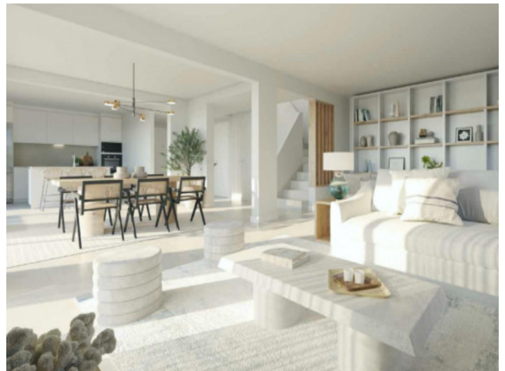
Open living and dining area