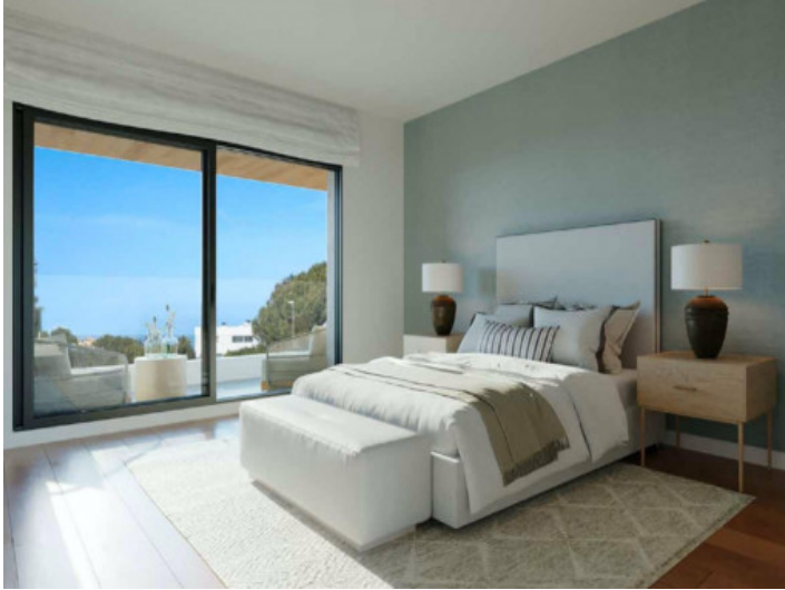
One of 4 bedrooms