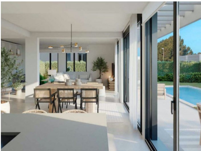
Living and dining area with terrace access