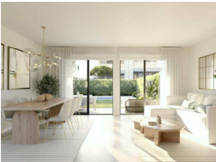
Spacious living and dining area