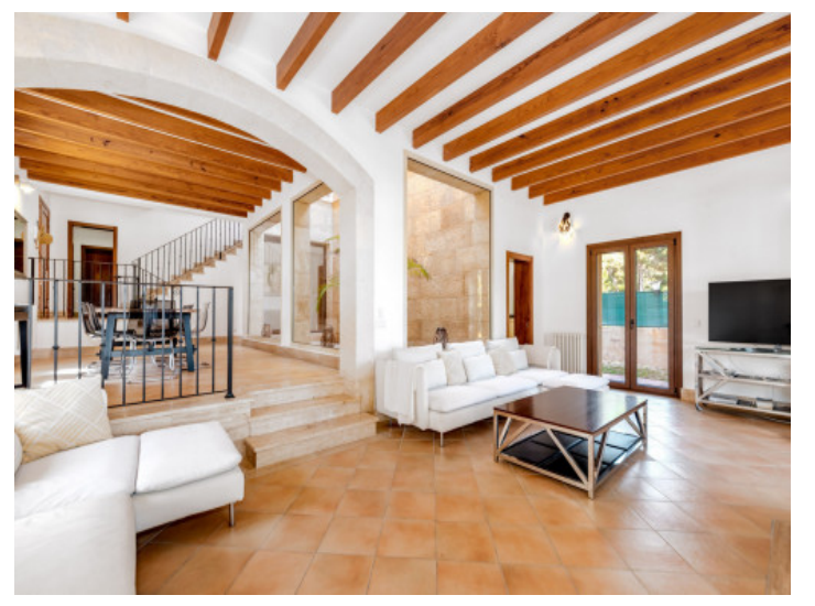
Living and dining room on 2 levels

All information is correct to the best of our knowledge. Errors and prior sale excepted. This prospectus is purely for information purposes. Only the notarized deed of sale is legally binding.