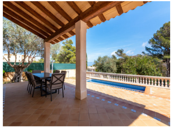
Covered terrace with dining area