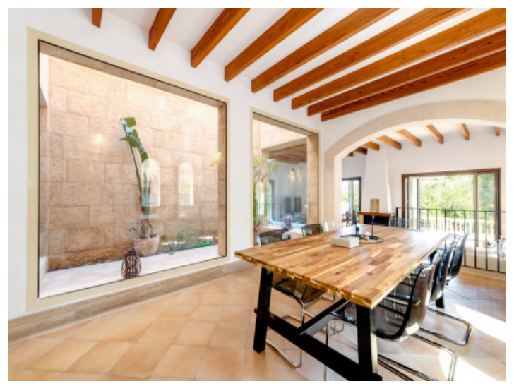
Dining area with glazed patio