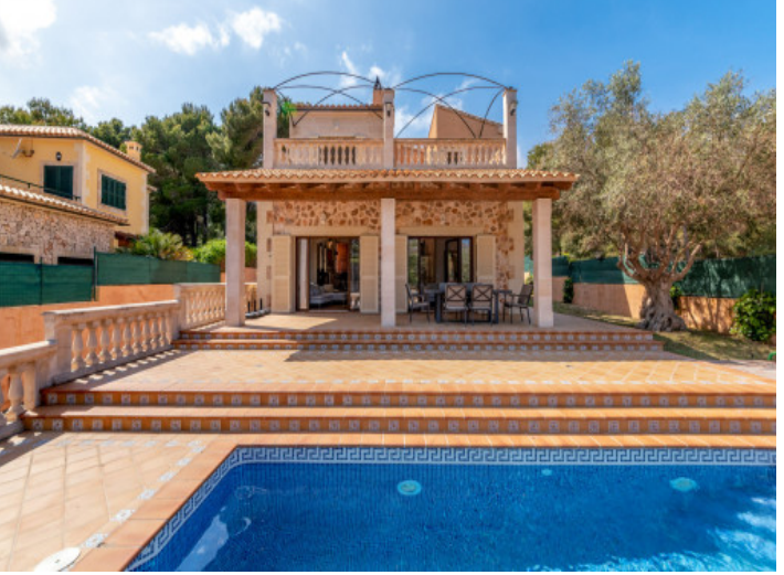
Alternative view of the villa