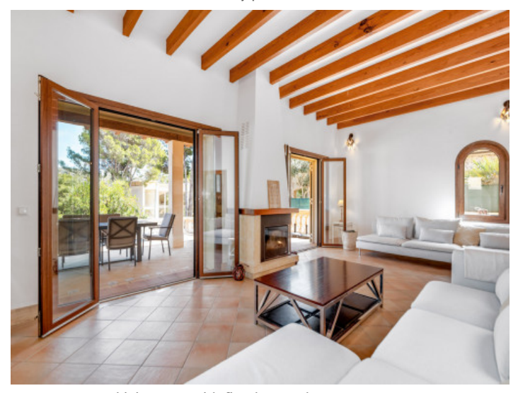
Living area with fireplace and terrace access