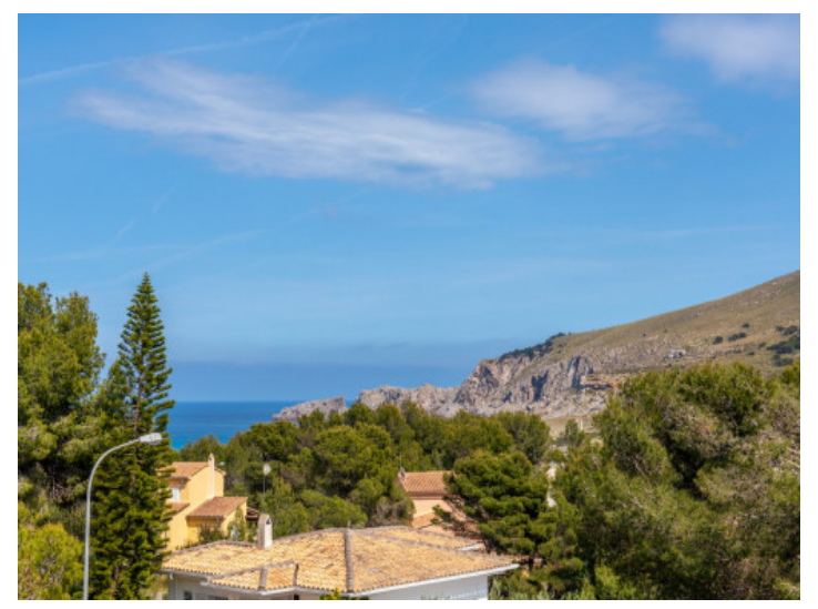
Beautiful sea views