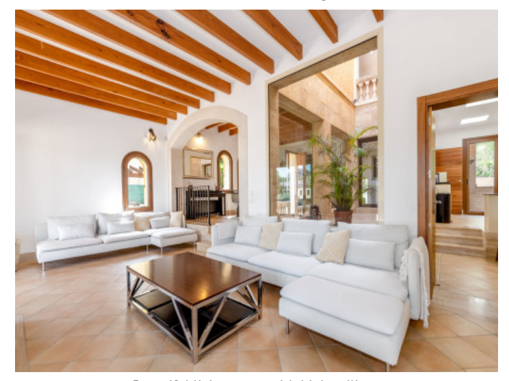
Beautiful living room with high ceilings