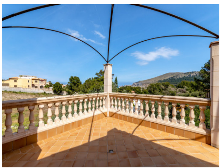
Terrace with sweeping views