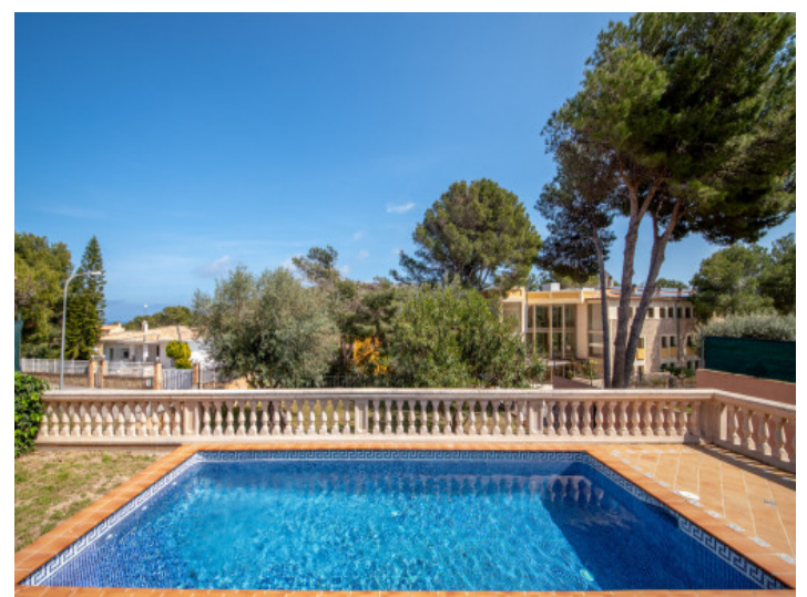
Sunny pool area