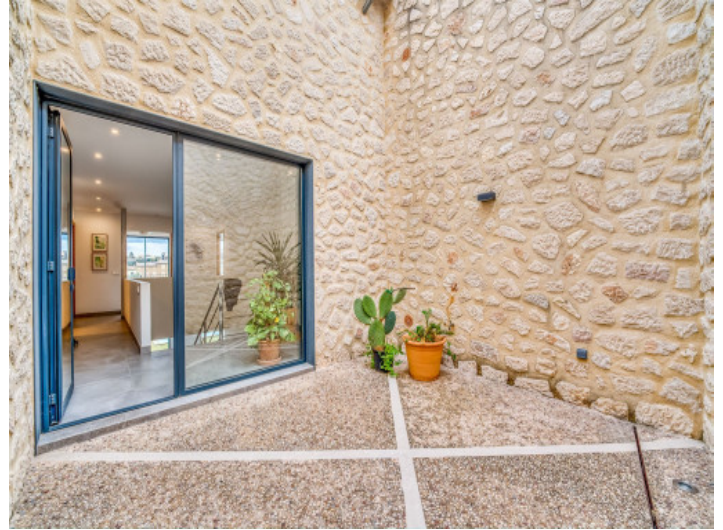
Patio with natural stone wall