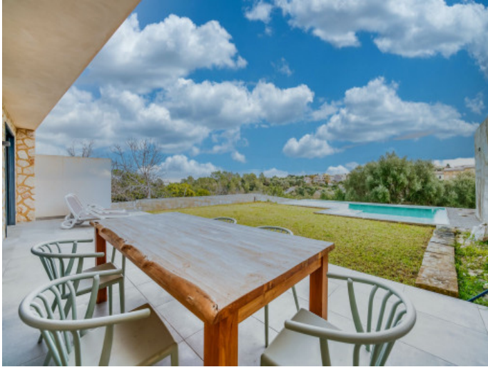
Terrace with a view