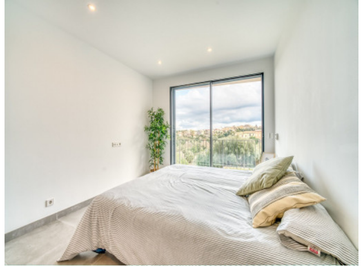
Master bedroom with bathroom en suite