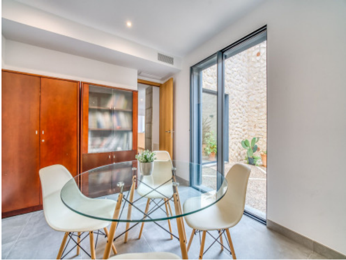
Separate dining area