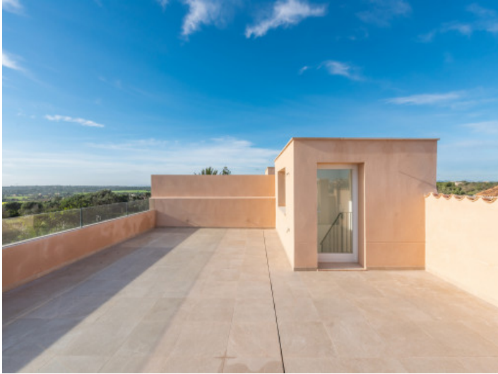
Terrace with a view