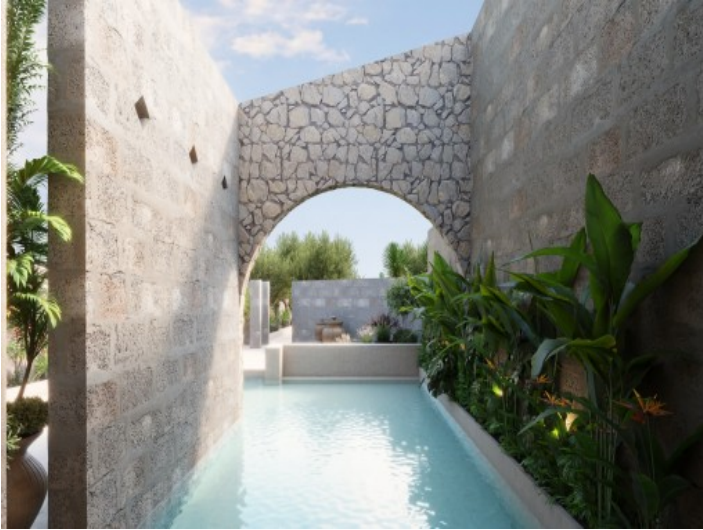
The swimming pool provides a lot of privacy