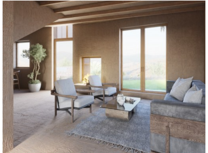
Modern interior design