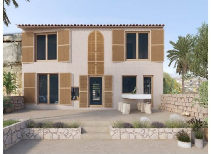
Facade view with outdoor terrace