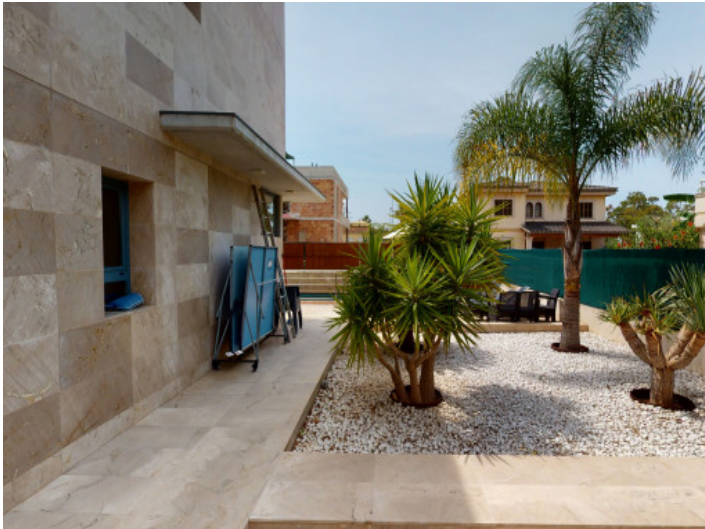
Access and garden