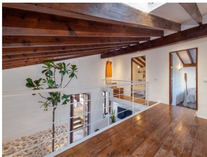
Open gallery with wooden ceiling beams