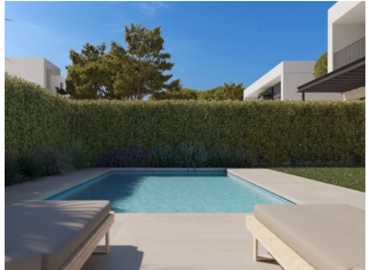
Sun loungers by the pool