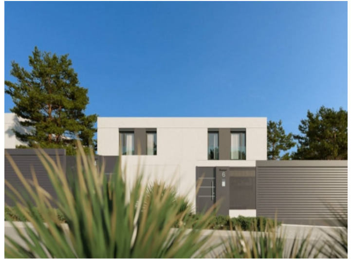
Exterior view of the house