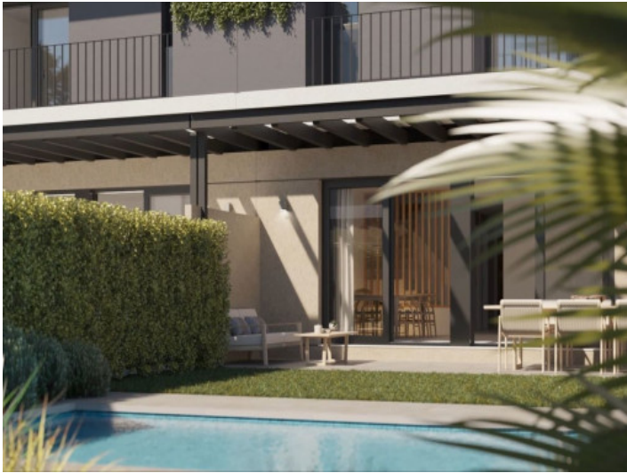
Garden and pool