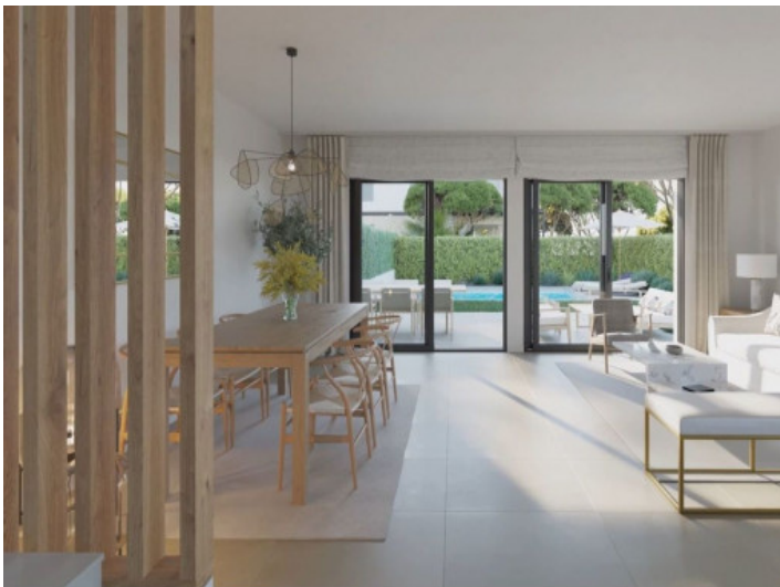
Light flooded living area