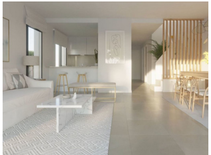
Alternative view of the living area