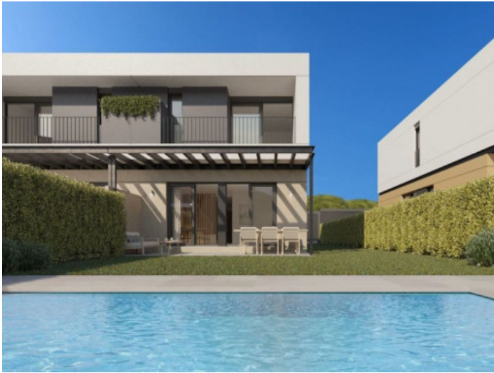
View from the pool