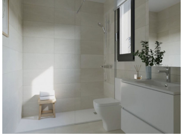
Elegant bathroom with walk-in shower