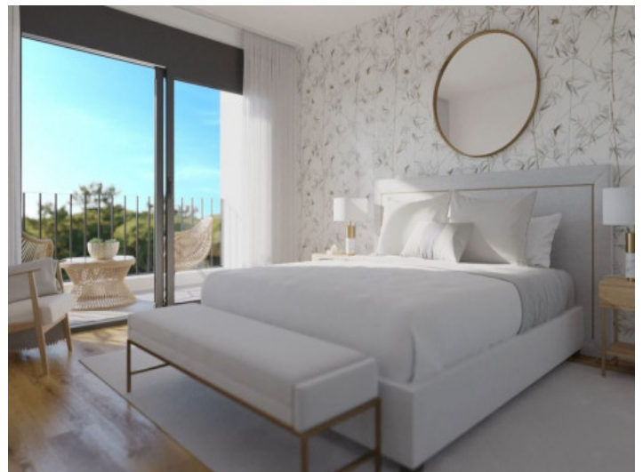
Noble double bedroom with balcony

All information is correct to the best of our knowledge. Errors and prior sale excepted. This prospectus is purely for information purposes. Only the notarized deed of sale is legally binding.