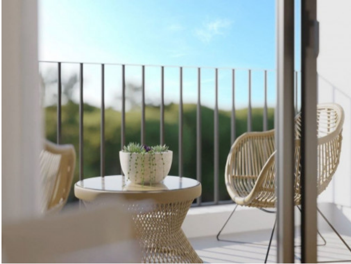
View to the balcony