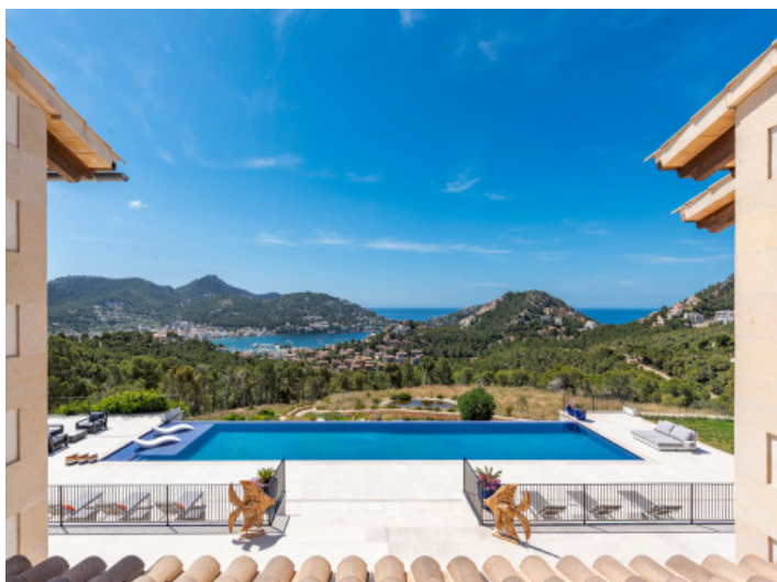
View to the pool