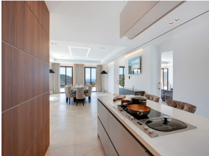
Fantastic cooking island