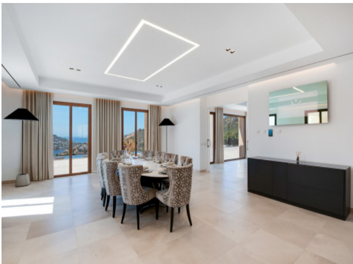
Noble dining area