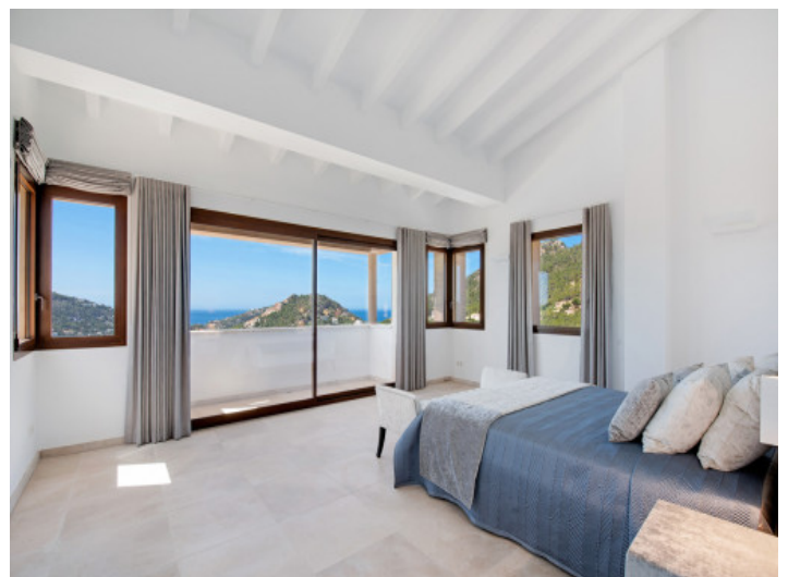
Large double bedroom suite

All information is correct to the best of our knowledge. Errors and prior sale excepted. This prospectus is purely for information purposes. Only the notarized deed of sale is legally binding.