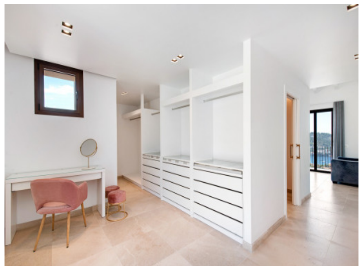
Dressing room en suite

All information is correct to the best of our knowledge. Errors and prior sale excepted. This prospectus is purely for information purposes. Only the notarized deed of sale is legally binding.