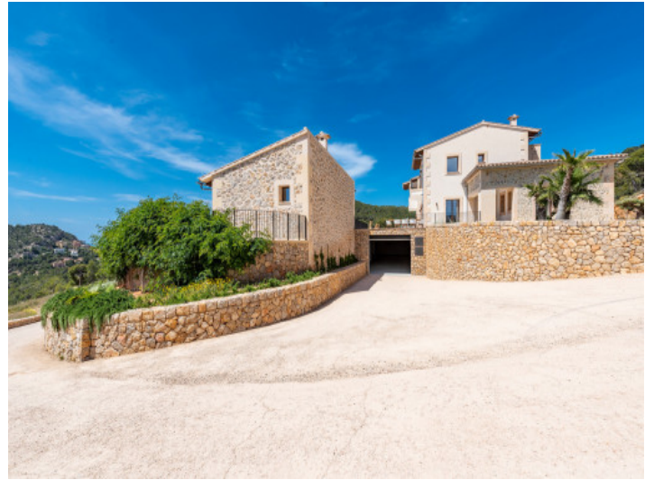
Access to the garage