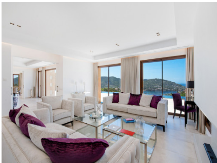
Separate living area