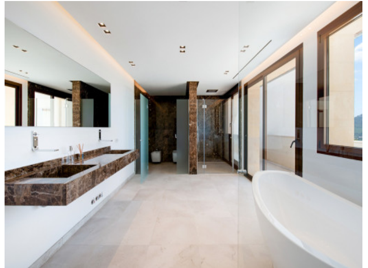
Bathroom en suite with both shower and bath tub