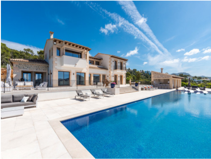
Exterior view and pool area