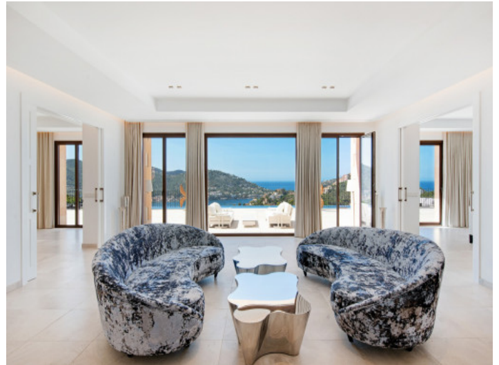
Light flooded living area with access to the terrace