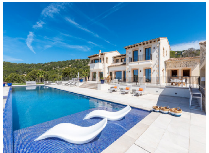
Alternative exterior view

All information is correct to the best of our knowledge. Errors and prior sale excepted. This prospectus is purely for information purposes. Only the notarized deed of sale is legally binding.