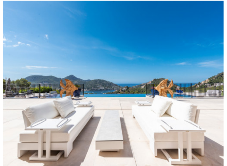
Splendid chill out lounge by the pool