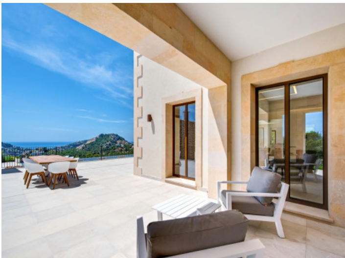
Covered chill out area