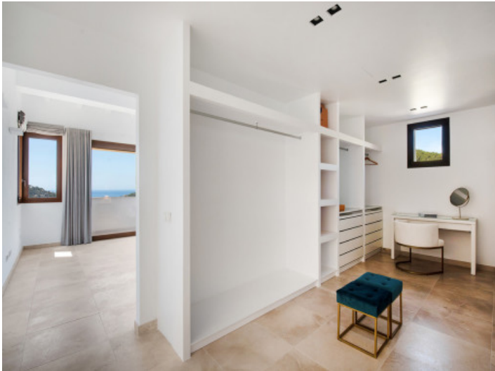
Spacious dressing room