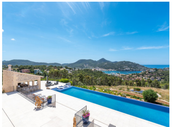
View to the terrace