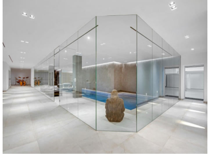
Elegant spa area and access to the garage