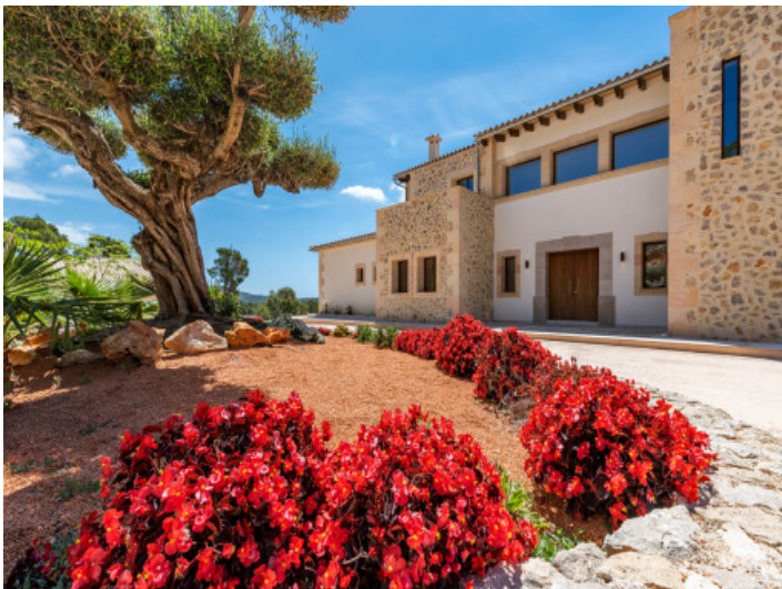
Alternative exterior view

All information is correct to the best of our knowledge. Errors and prior sale excepted. This prospectus is purely for information purposes. Only the notarized deed of sale is legally binding.