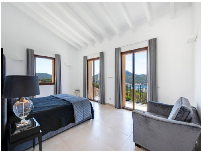
Another elegant double bedroom