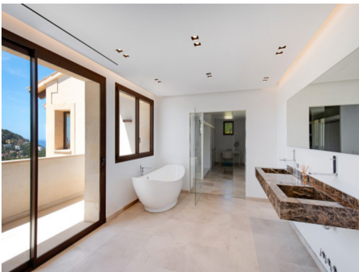
Alternative view of this bathroom