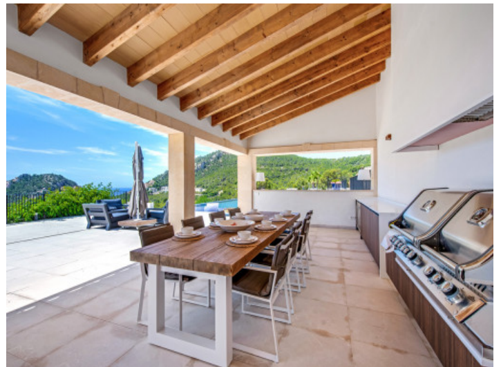
Covered exterior kitchen and dining area