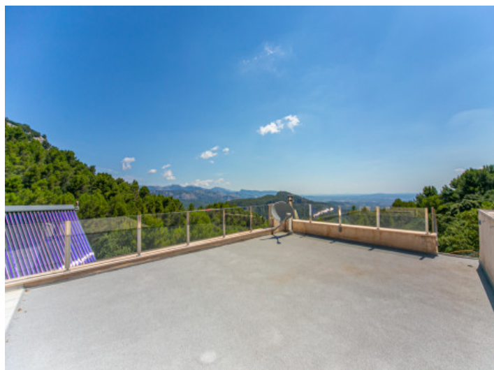
Large roof terrace

All information is correct to the best of our knowledge. Errors and prior sale excepted. This prospectus is purely for information purposes. Only the notarized deed of sale is legally binding.