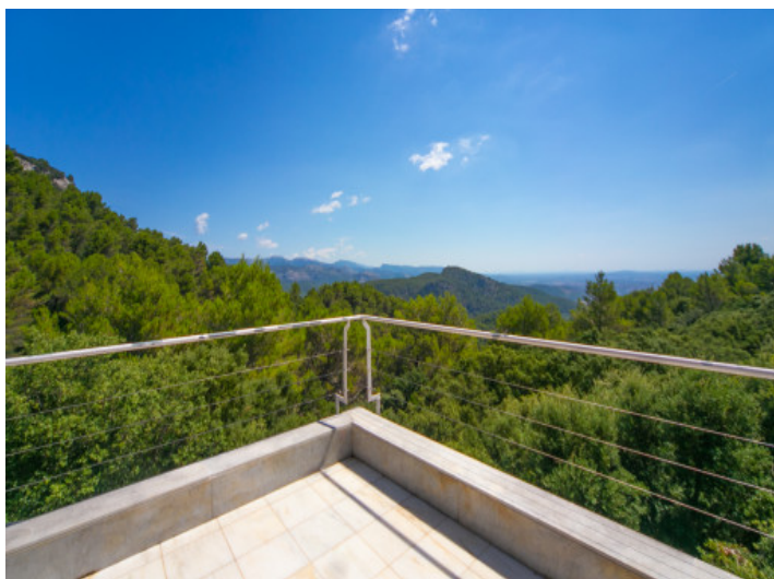
Lovely terrace with mountain views