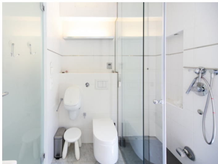
One of 2 bathrooms