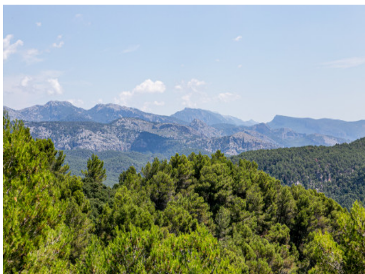
Fantastic view over the Serra de Tramuntana