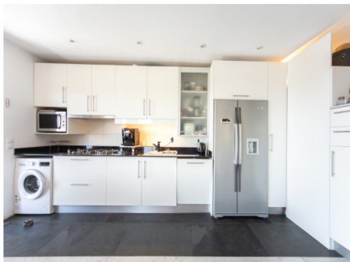
Modern, fully equipped kitchen

All information is correct to the best of our knowledge. Errors and prior sale excepted. This prospectus is purely for information purposes. Only the notarized deed of sale is legally binding.