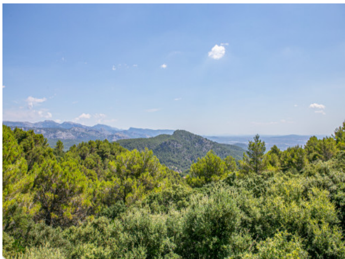
Dreamlike panoramic views