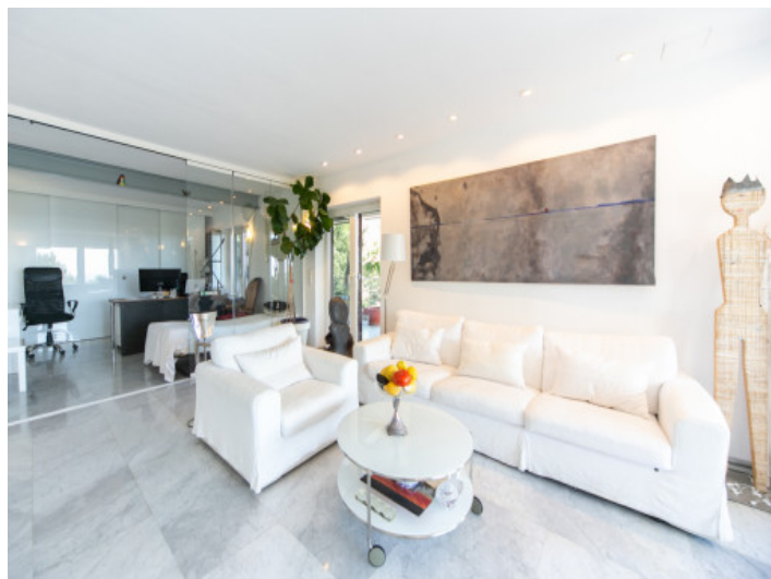
Bright living area