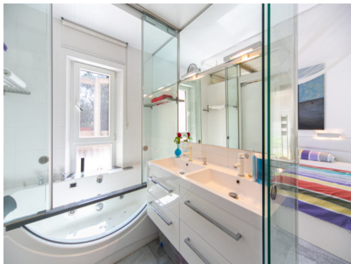
Open bathroom en suite