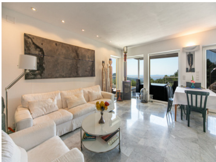
Living and dining area with terrace access