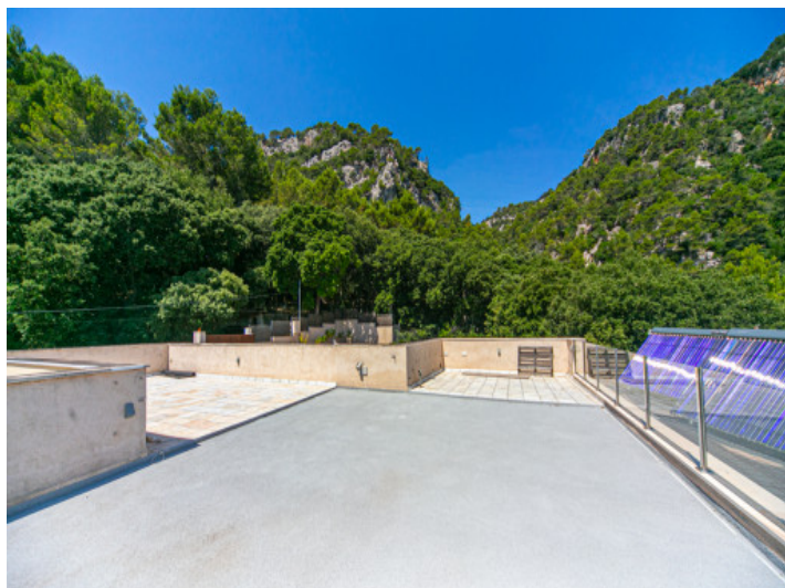
Terrace with mountains in the back