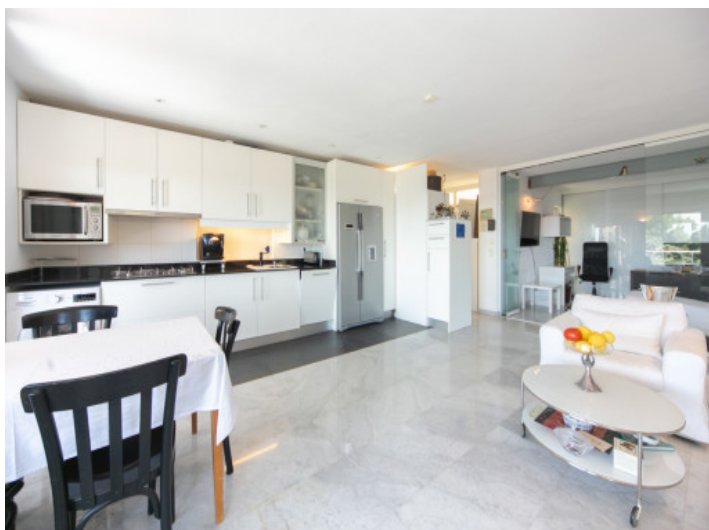
Open plan living, dining and kitchen area