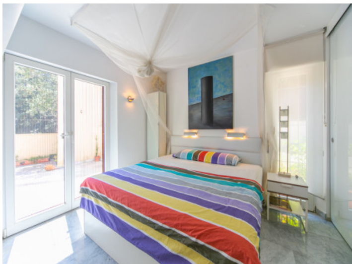
One of 2 bedrooms