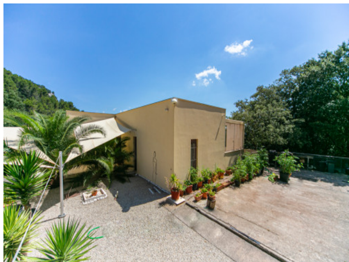
Exterior view and outdoor area