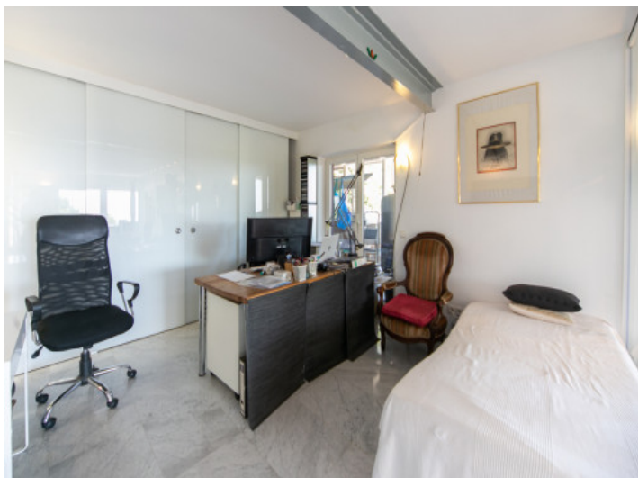
Bedroom and office