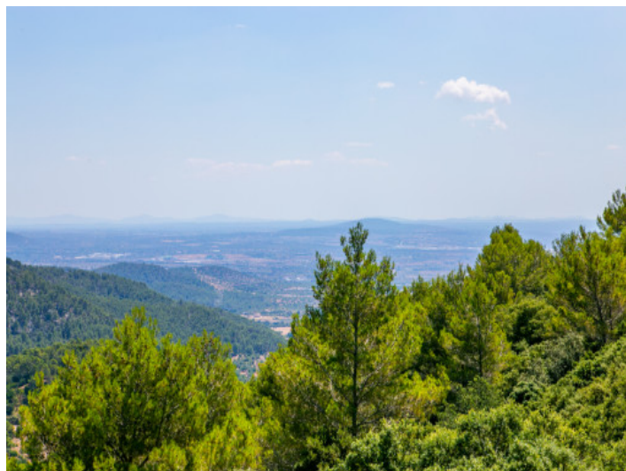
Impressive sweeping views