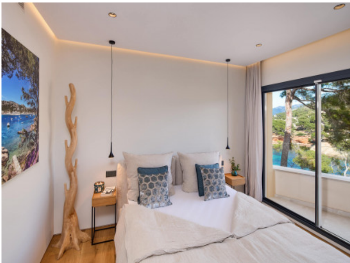
Bedroom with balcony