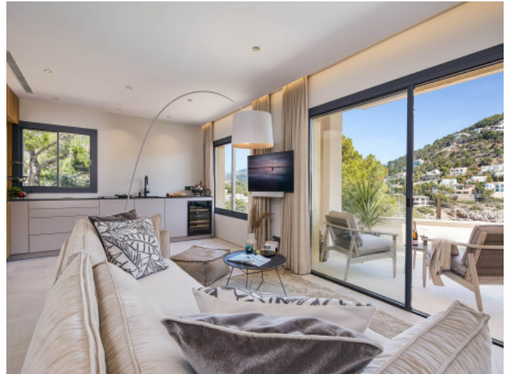
Open living area