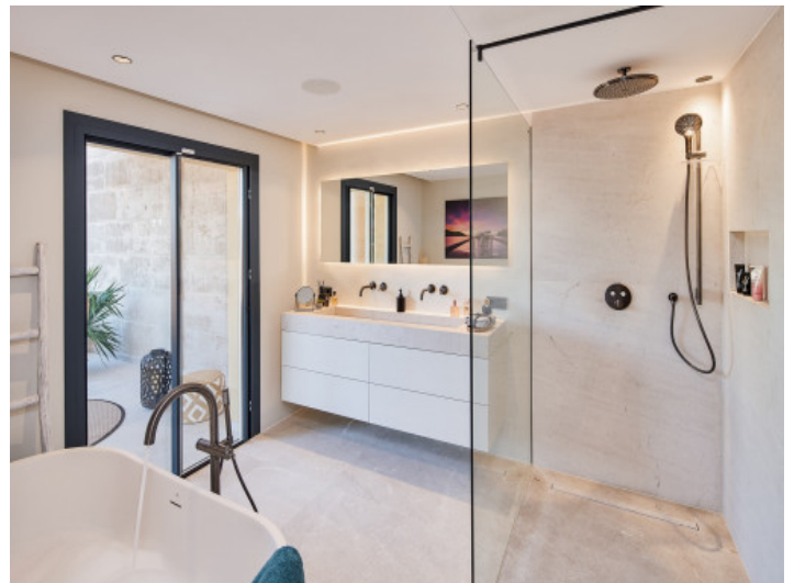
Bathroom with shower