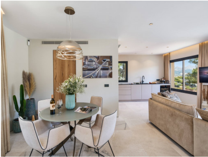
Open living and dining area