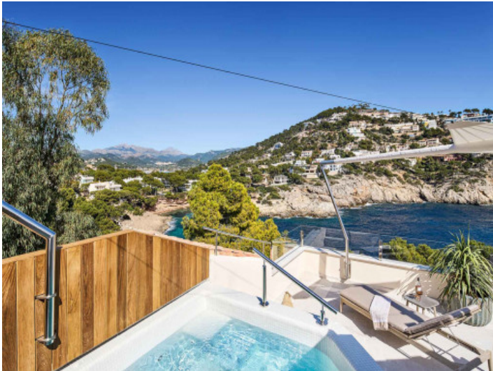
Jacuzzi with sea views