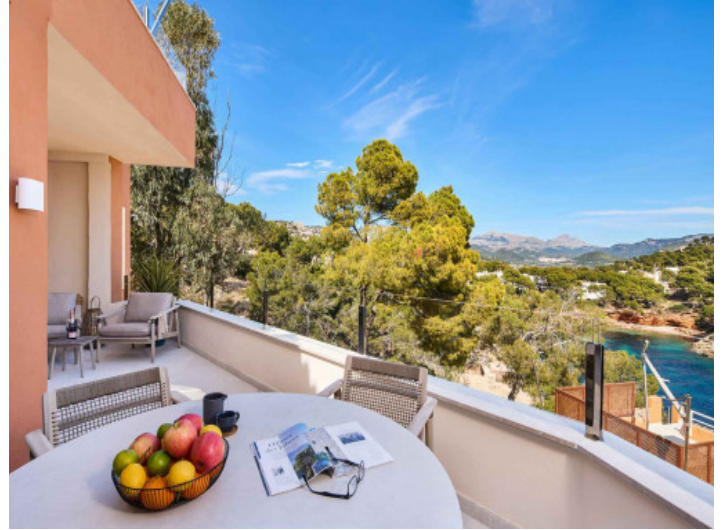
Mediterranean sea views from the balcony