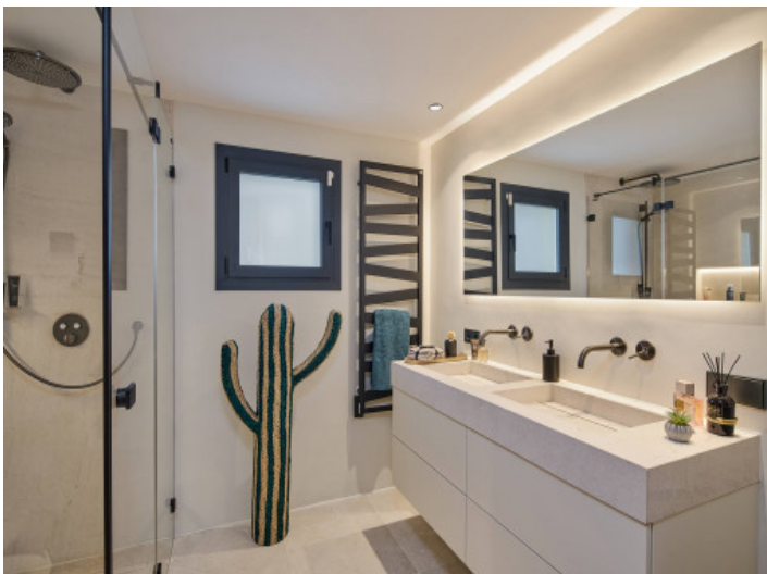
Bathroom with daylight