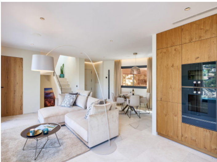
Views from the kitchen to the living area