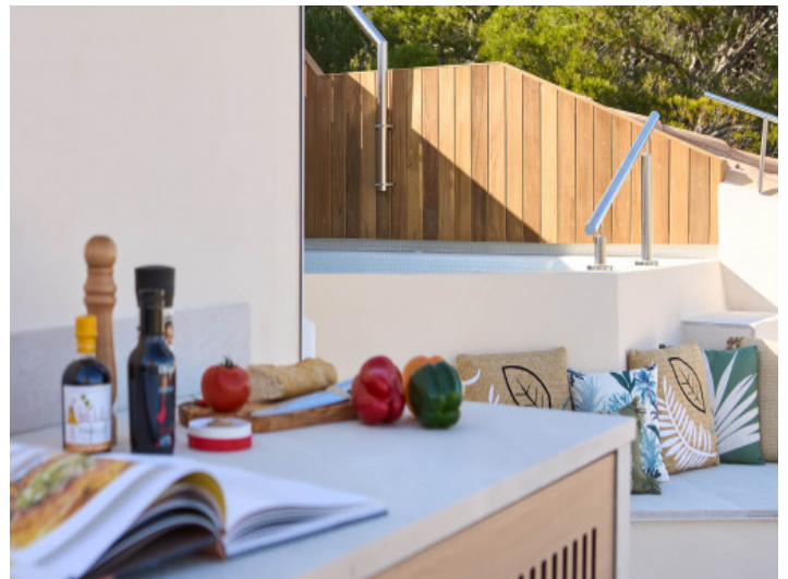
Lovely designed terrace