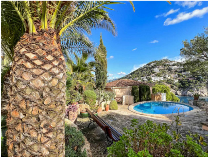
Mediterranean garden with pool