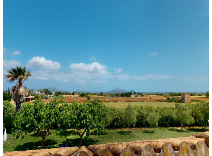
Wonderful views over the landscape