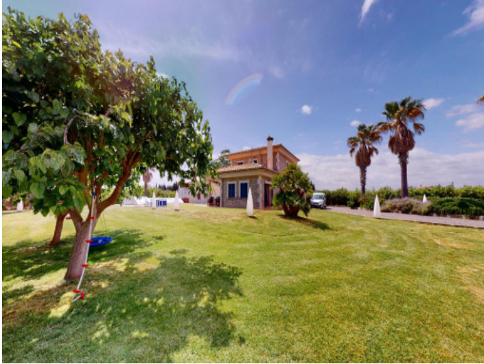
Natural-stone finca with pool and olive tree plantation near Playa de Muro