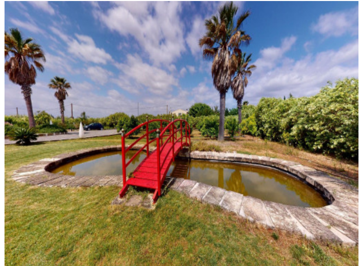
Natural pond in the garden