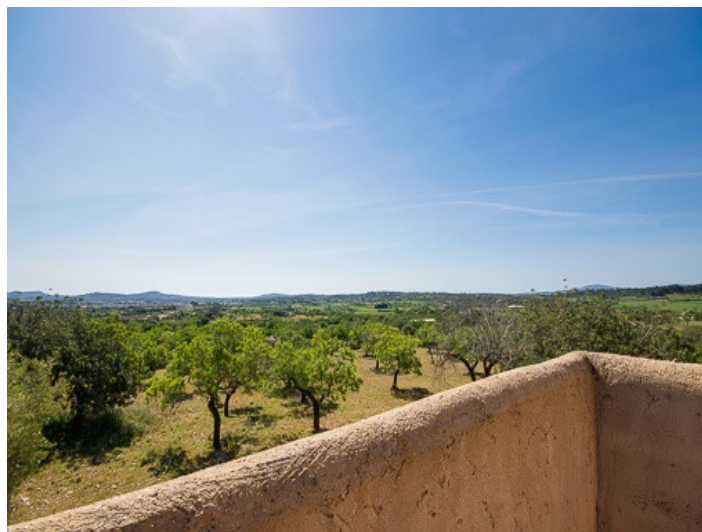
Fantastic panoramic view of the surrounding