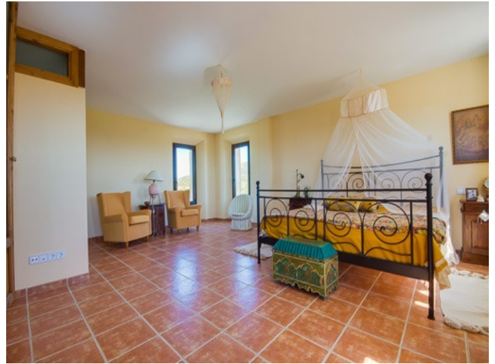
One of six bedrooms