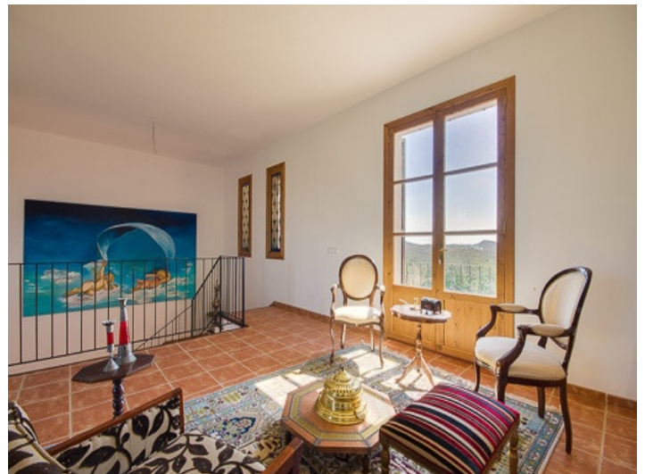
Gallery on the upper floor