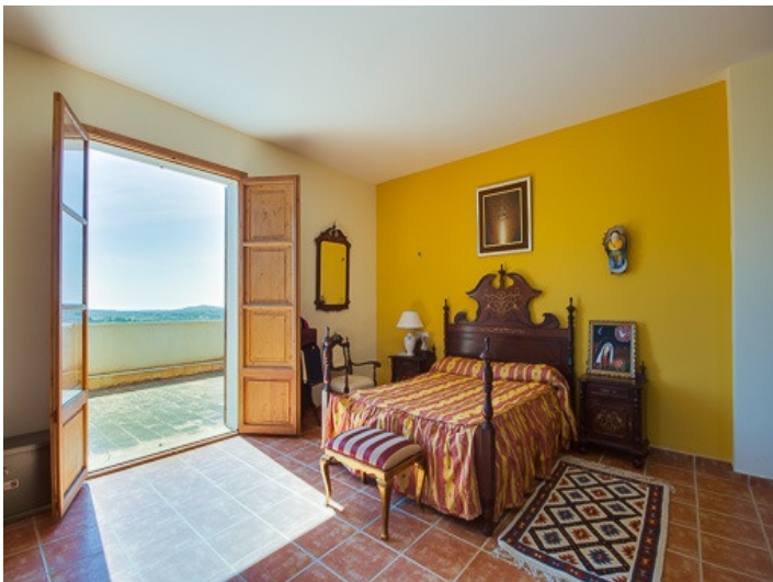
Bedroom with access to terrace