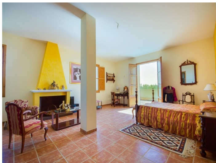
Master bedroom with fireplace

All information is correct to the best of our knowledge. Errors and prior sale excepted. This prospectus is purely for information purposes. Only the notarized deed of sale is legally binding.