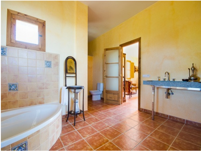
One of five bathrooms