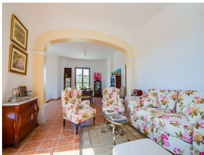
Cosy living area