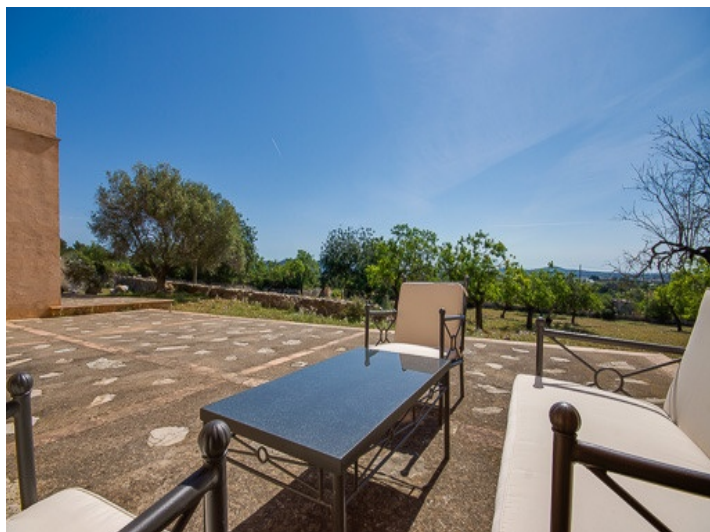
Spacious terrace with seating area