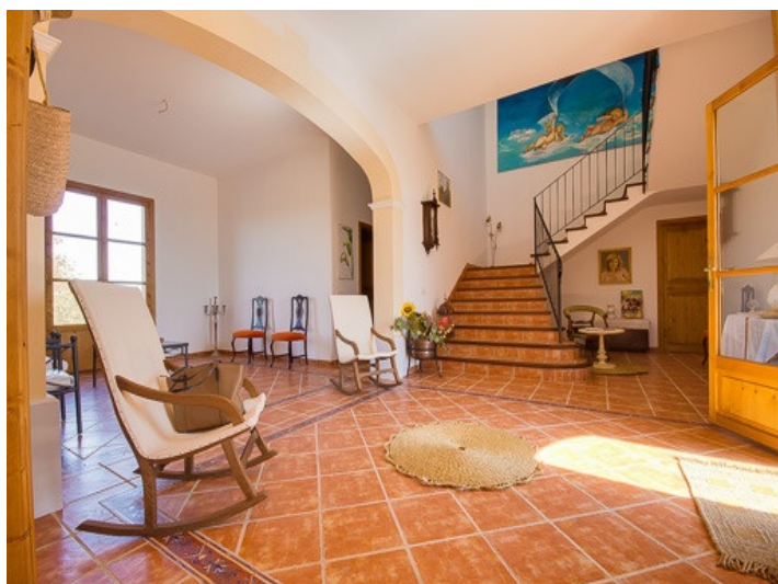
Inviting entrance area