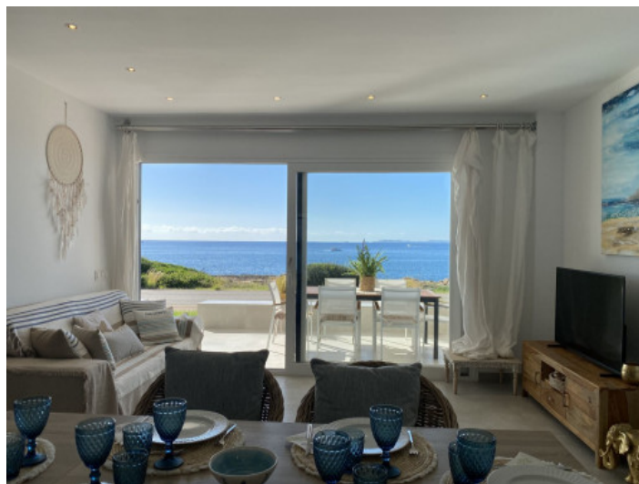
Living area with sea views