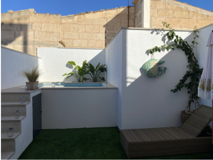
Small pool in the patio