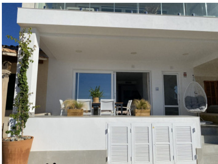
Terrace of the apartment