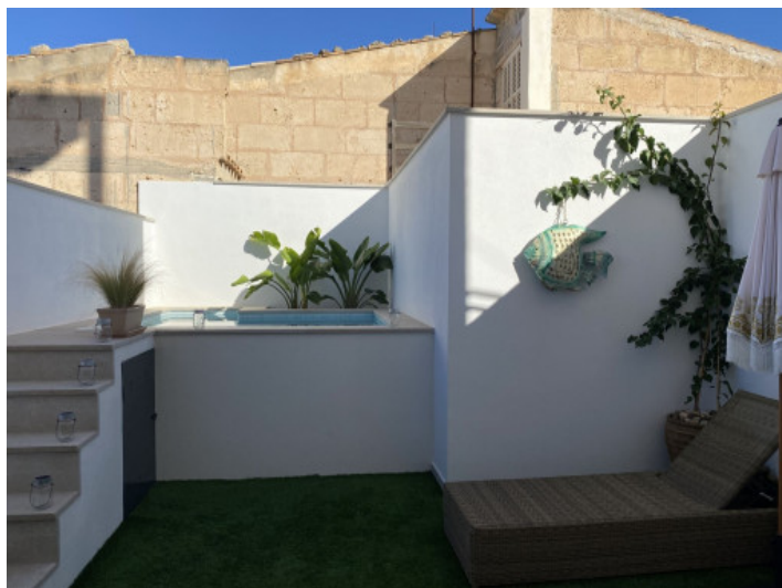
Small pool in the patio