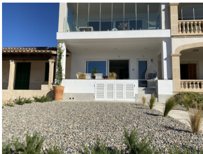
View to the Apartment

All information is correct to the best of our knowledge. Errors and prior sale excepted. This prospectus is purely for information purposes. Only the notarized deed of sale is legally binding.