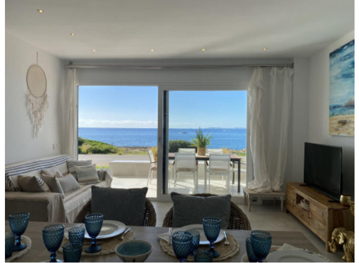
Living area with sea views