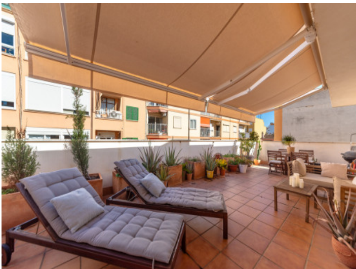
Nice terrace in the middle of the city