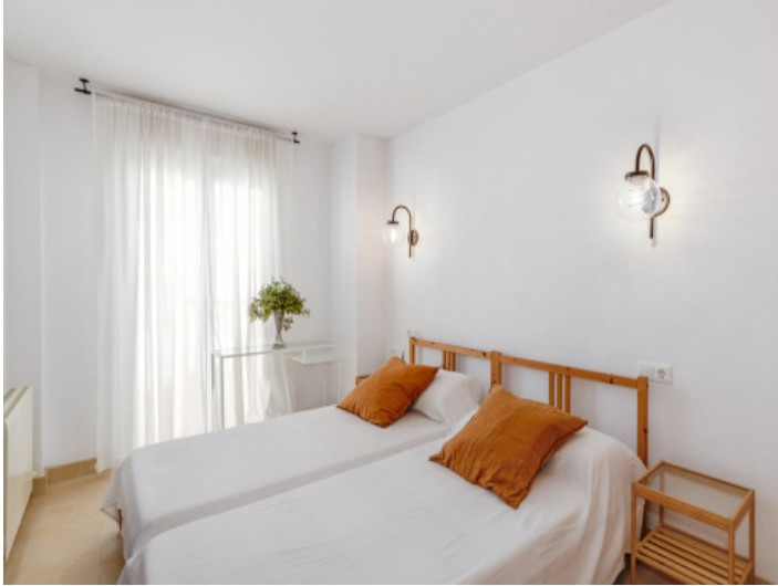
One of 2 bedrooms