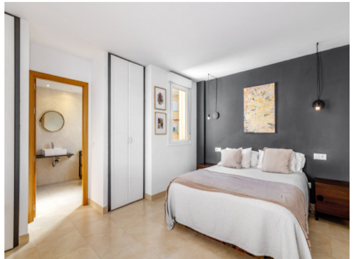
One of 2 bedrooms

All information is correct to the best of our knowledge. Errors and prior sale excepted. This prospectus is purely for information purposes. Only the notarized deed of sale is legally binding.