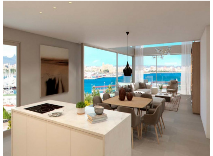
Dining area and kitchen