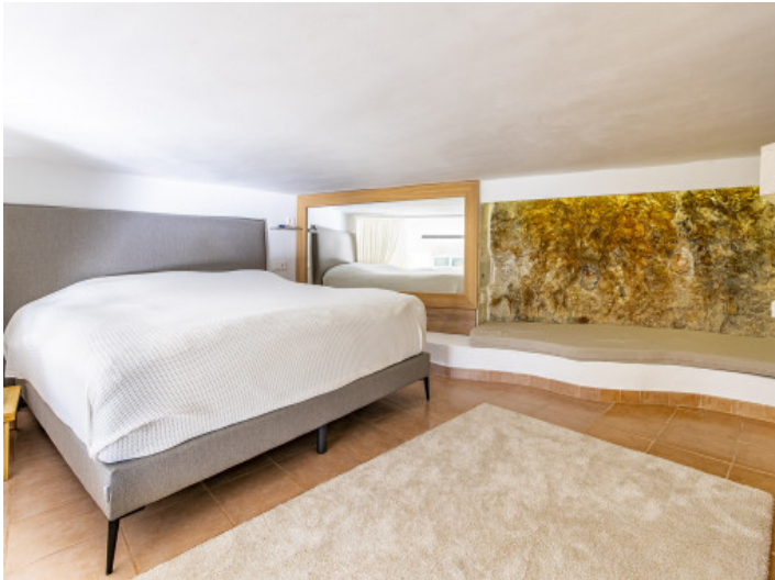
Mediterran sea views from the bedroom