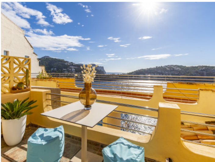
Views over the sea from the balcony