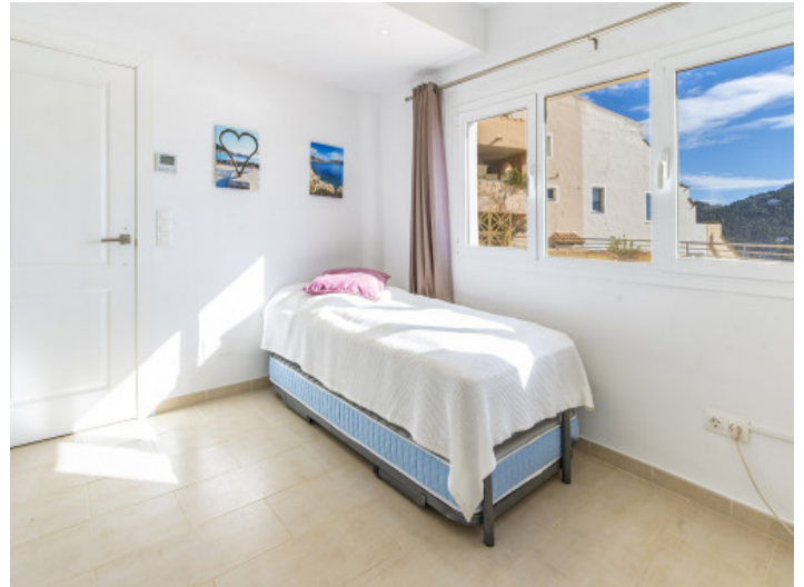
One of two bedrooms