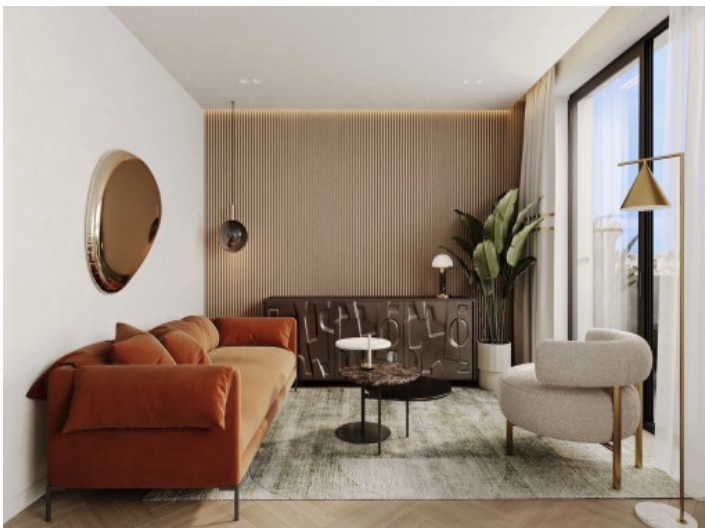
Inviting living area