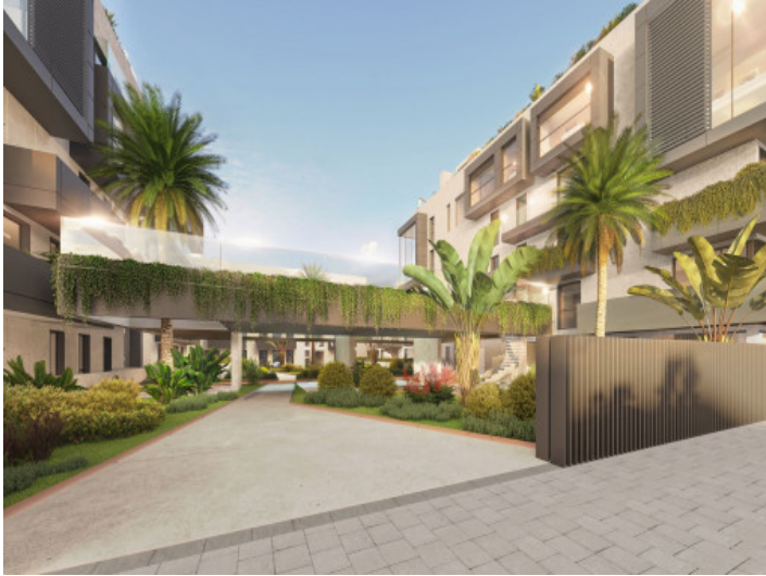
Entrance to the residential complex