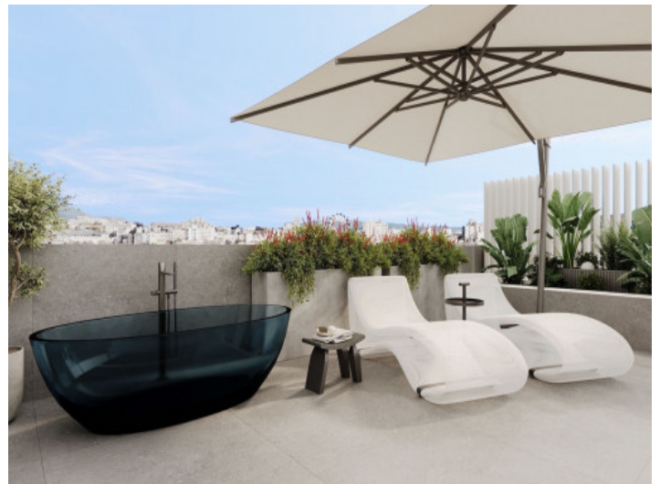
Roof terrace with sun loungers