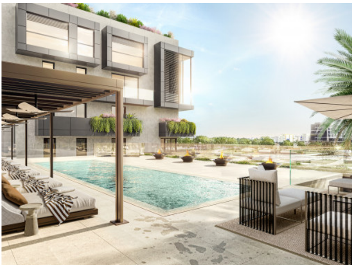
Luxurious pool area