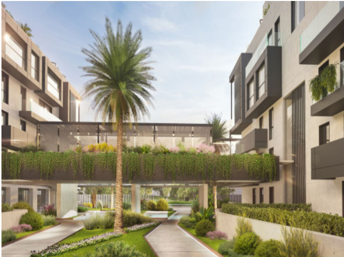
Beautifully designed garden