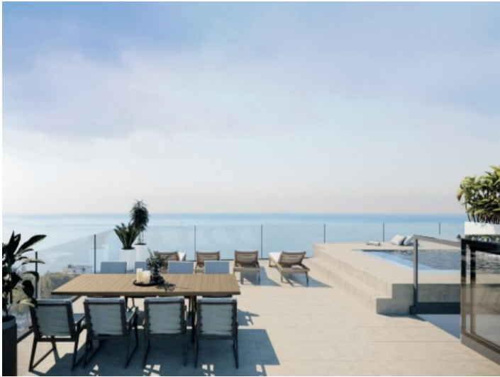
Roof terrace and pool