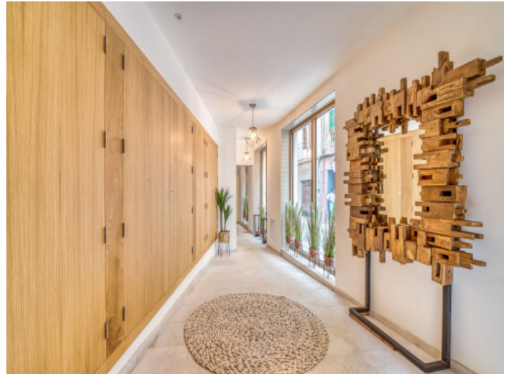
Entrance hall of the building