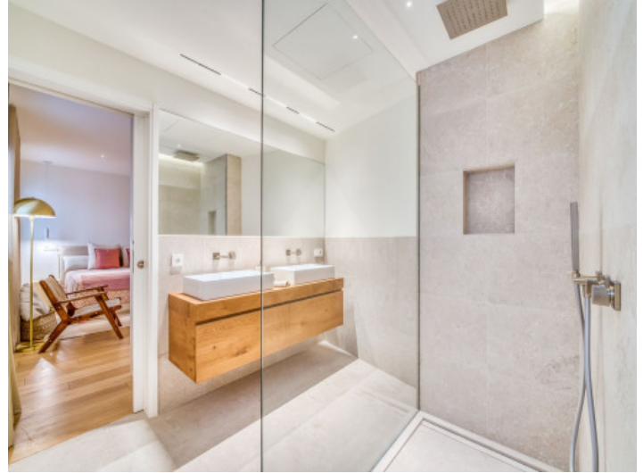
Bathroom with walk - in shower