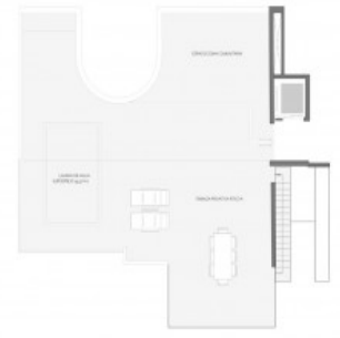
Plan Penthouse 2

All information is correct to the best of our knowledge. Errors and prior sale excepted. This prospectus is purely for information purposes. Only the notarized deed of sale is legally binding.