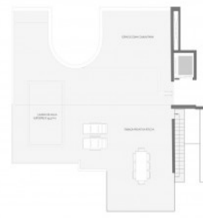
Plan Penthouse 2

All information is correct to the best of our knowledge. Errors and prior sale excepted. This prospectus is purely for information purposes. Only the notarized deed of sale is legally binding.