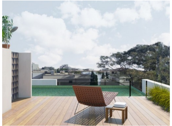
Pool and sun terrace