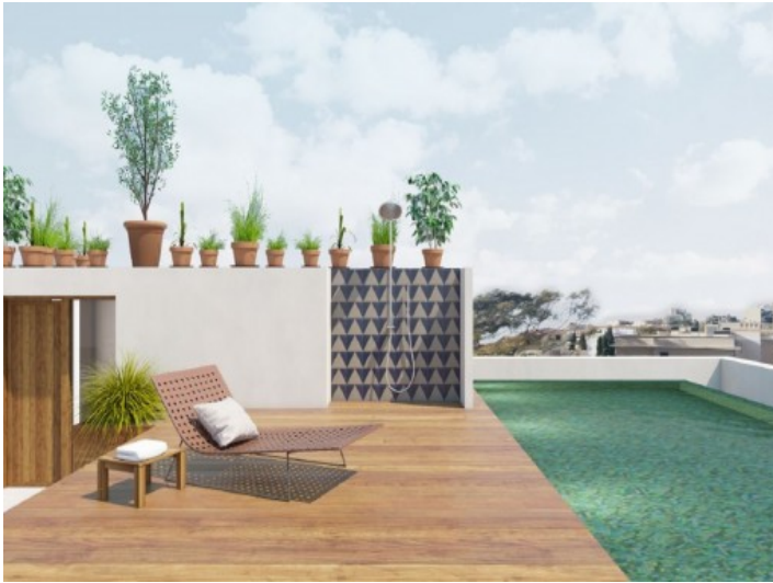
Pool and sun terrace