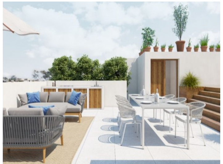
Lounge terrace and dining area