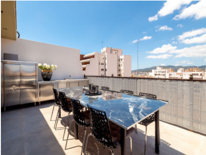
Outdoor dining area on the terrace