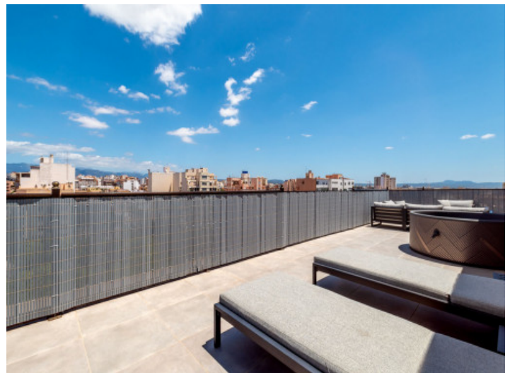
Terrace with a view

All information is correct to the best of our knowledge. Errors and prior sale excepted. This prospectus is purely for information purposes. Only the notarized deed of sale is legally binding.