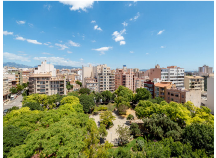
Views over the parque