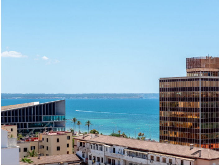
Fantastic views to the sea