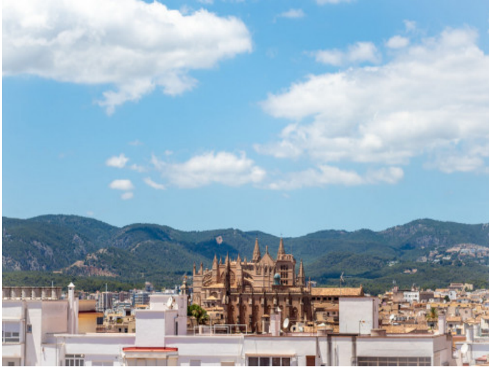
View as far as the cathedral