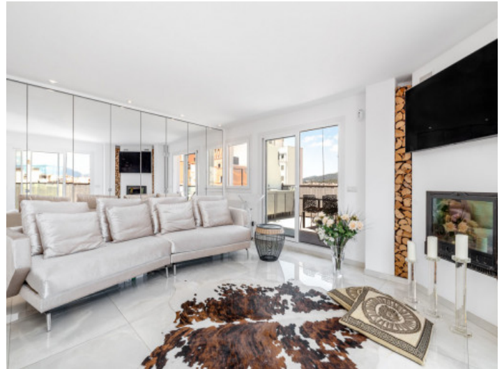
Living area with terrace access