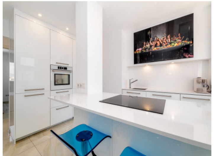
Modern kitchen with cooking island

All information is correct to the best of our knowledge. Errors and prior sale excepted. This prospectus is purely for information purposes. Only the notarized deed of sale is legally binding.