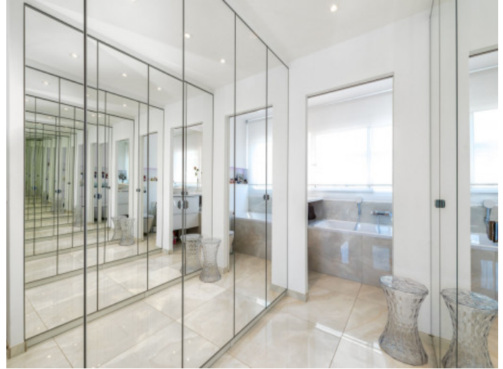
Adjoining dressing area