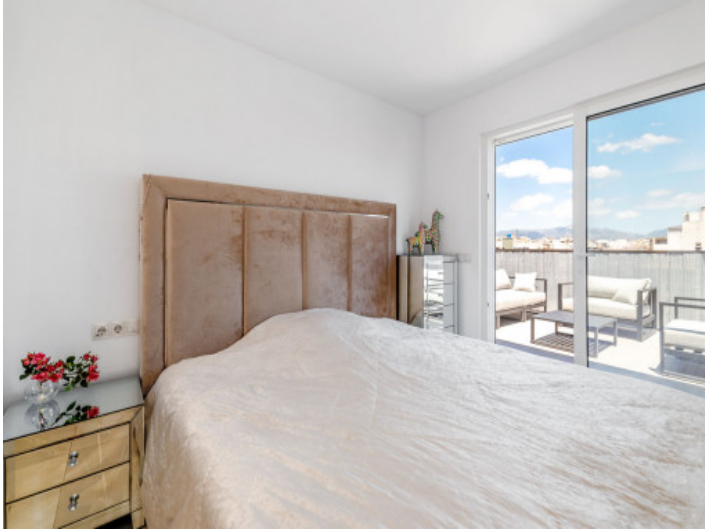
Bedroom with terrace access