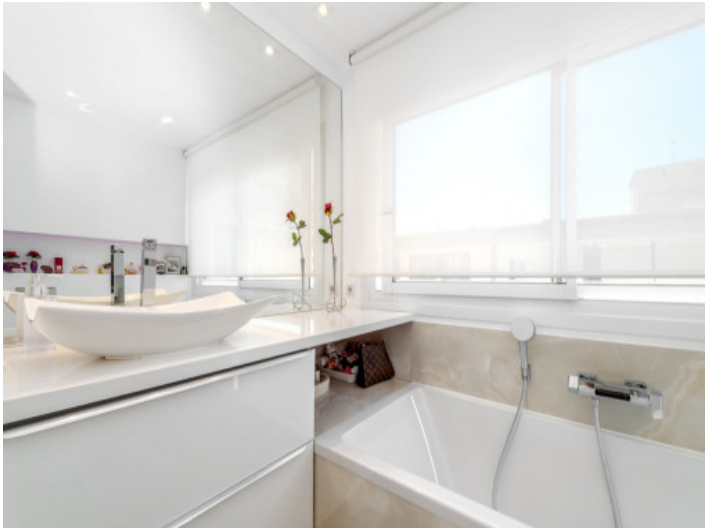
Modern bathroom with bathtub