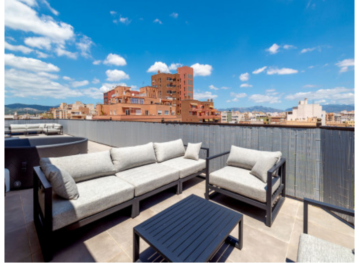
Large roof terrace