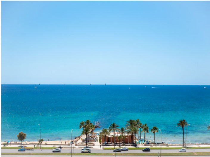
Sea and beach views