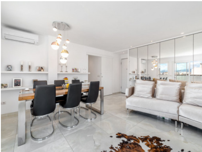
Elegant living and dining area