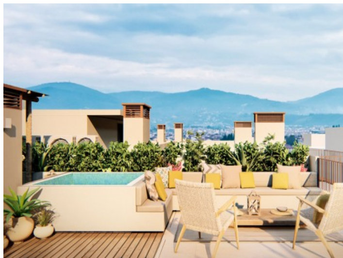
Spacious roof top terrace