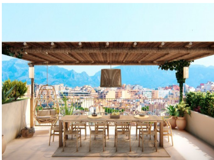
Alternative view of the dining area on the terrace

All information is correct to the best of our knowledge. Errors and prior sale excepted. This prospectus is purely for information purposes. Only the notarized deed of sale is legally binding.