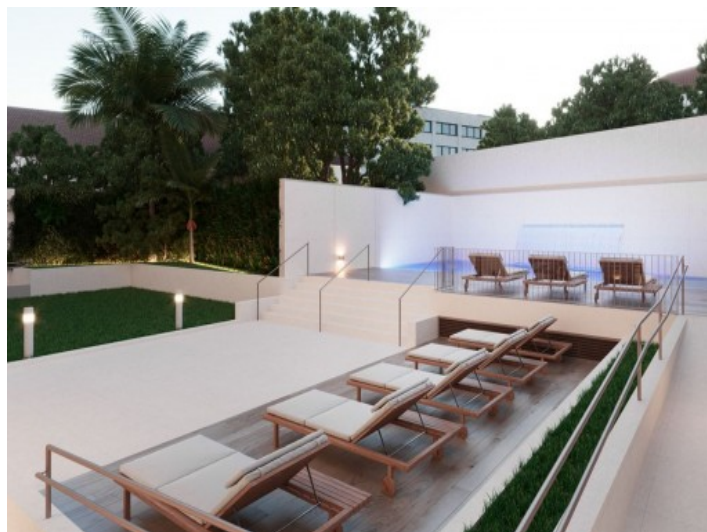
Inviting community pool area