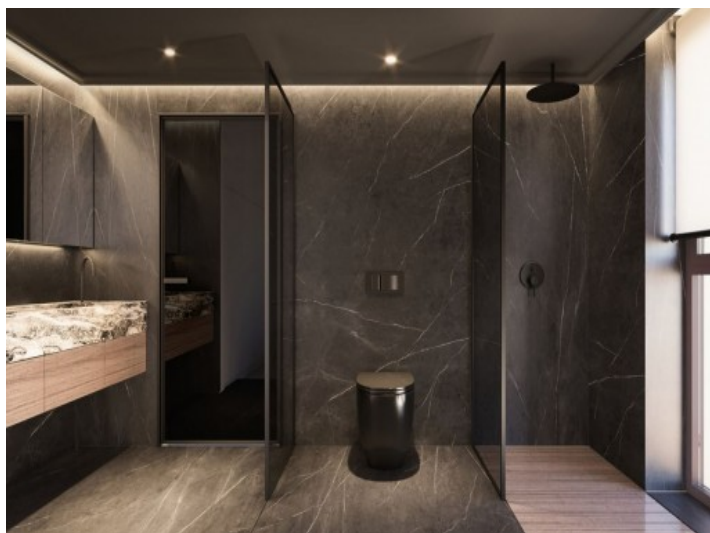
Bathroom - Glam