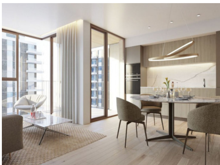
Kitchen with dining area