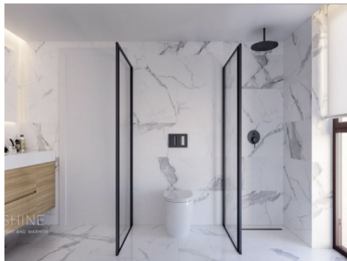
Bathroom - Shine