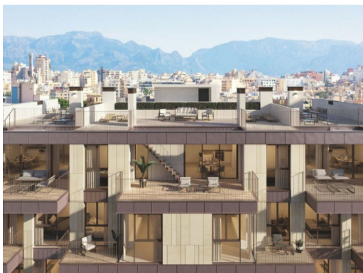
Exterior view of the complex

All information is correct to the best of our knowledge. Errors and prior sale excepted. This prospectus is purely for information purposes. Only the notarized deed of sale is legally binding.