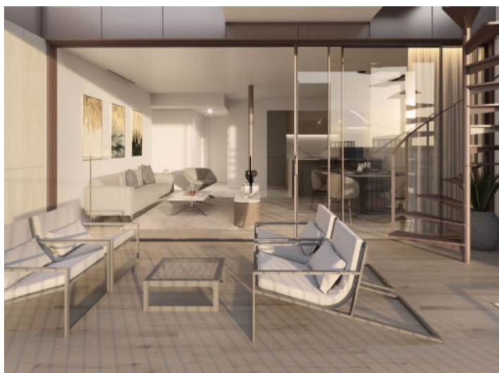
Terrace with sitting area