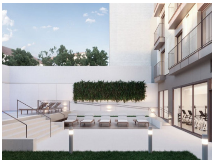
Terrace, pool and gym area