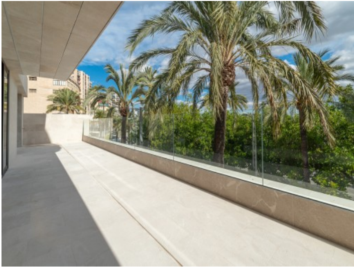
Large terrace with harbour views