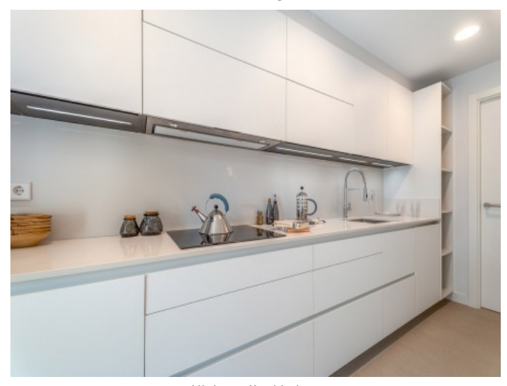
High quality kitchen