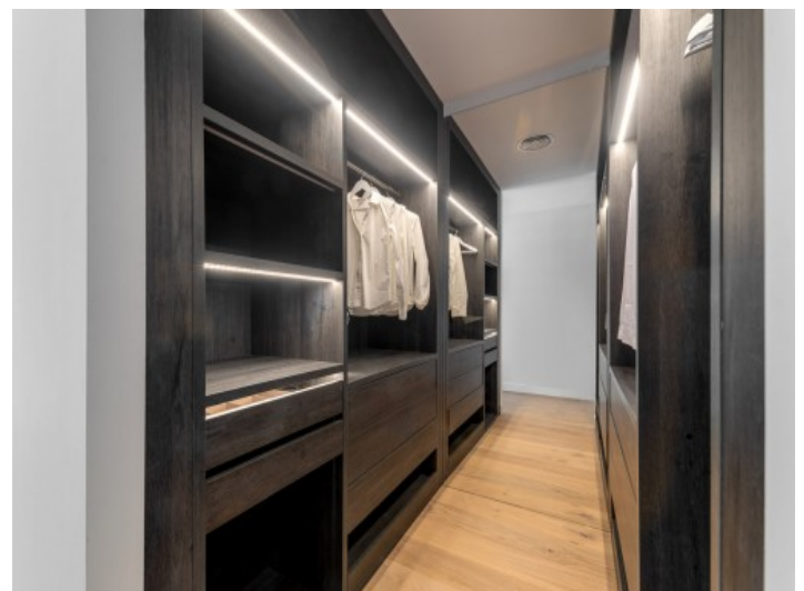
Spacious dressing room