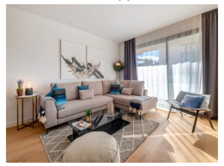
Modern living area