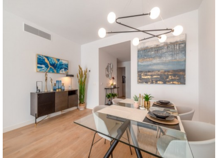
Adjoining dining area