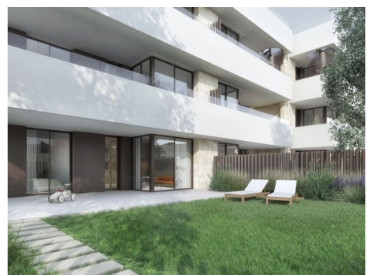
View of the large garden