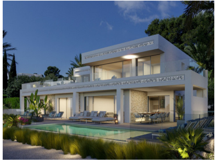
The villa by night