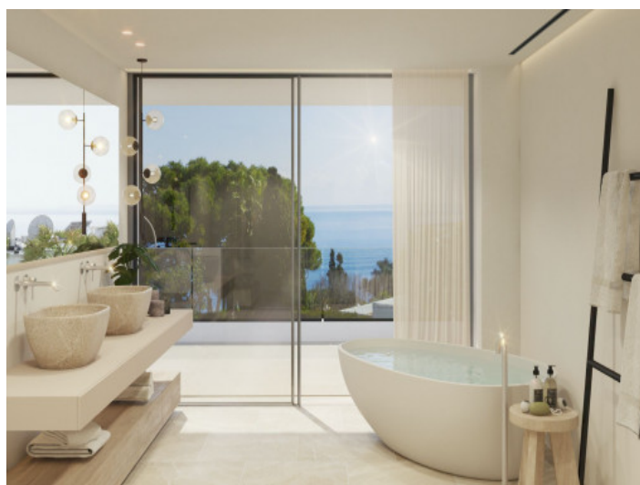
Bathroom with bath tub

All information is correct to the best of our knowledge. Errors and prior sale excepted. This prospectus is purely for information purposes. Only the notarized deed of sale is legally binding.