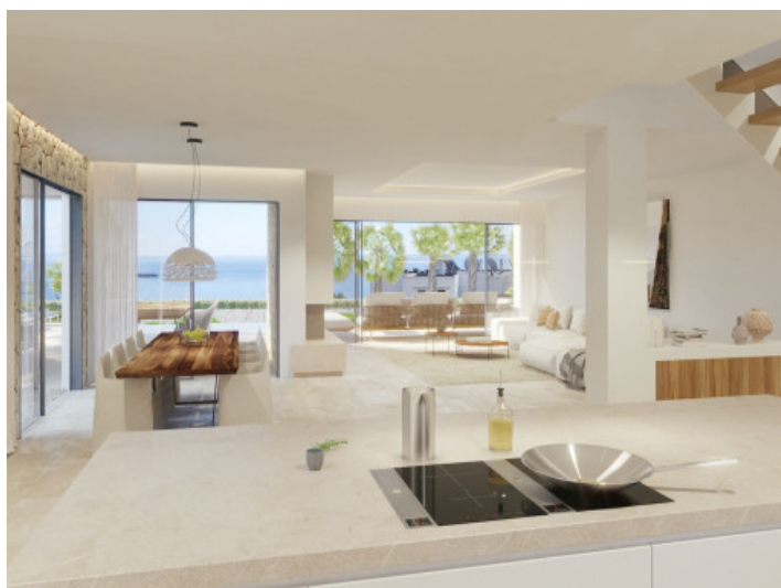
Open living area and kitchen