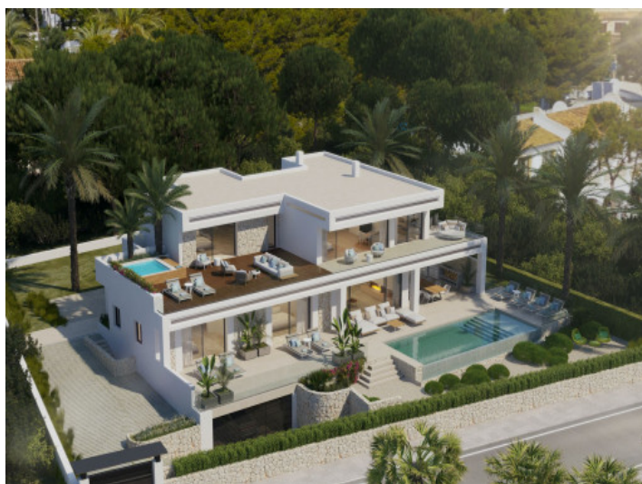
Exterior view of the villa