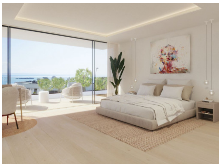
Master bedroom with bathroom en suite