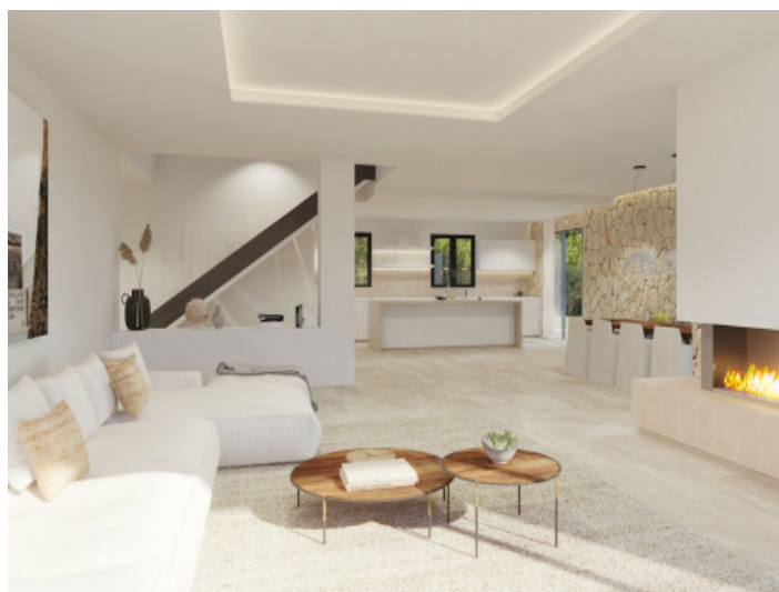
Cozy living area with fire place