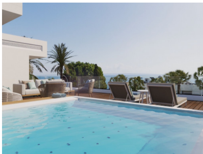
Inviting pool area