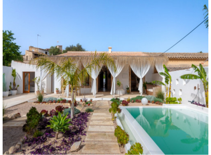
Beautiful villa with pool in Establiments