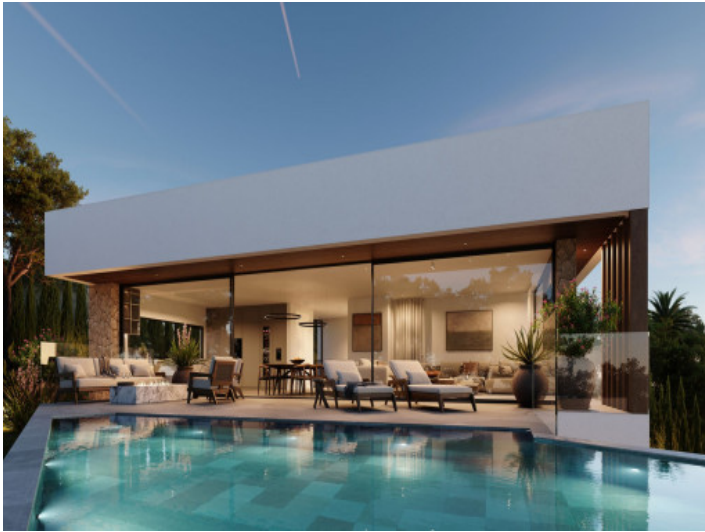
Pool area by night