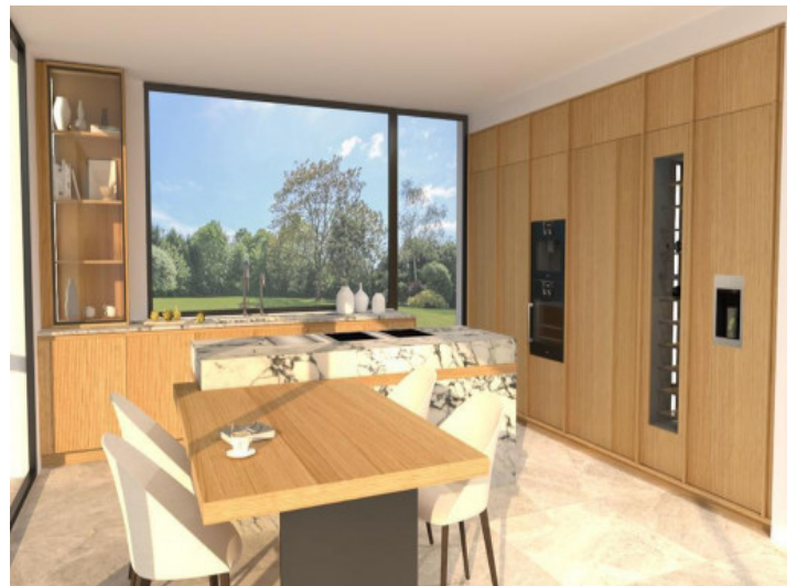
Kitchen and dining area