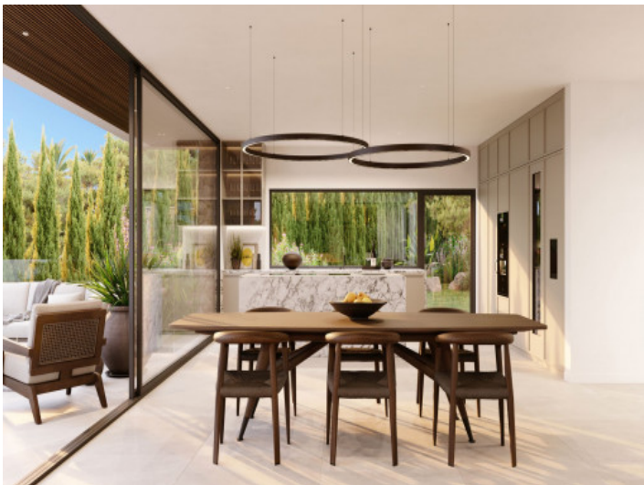
Dining area with terrace access