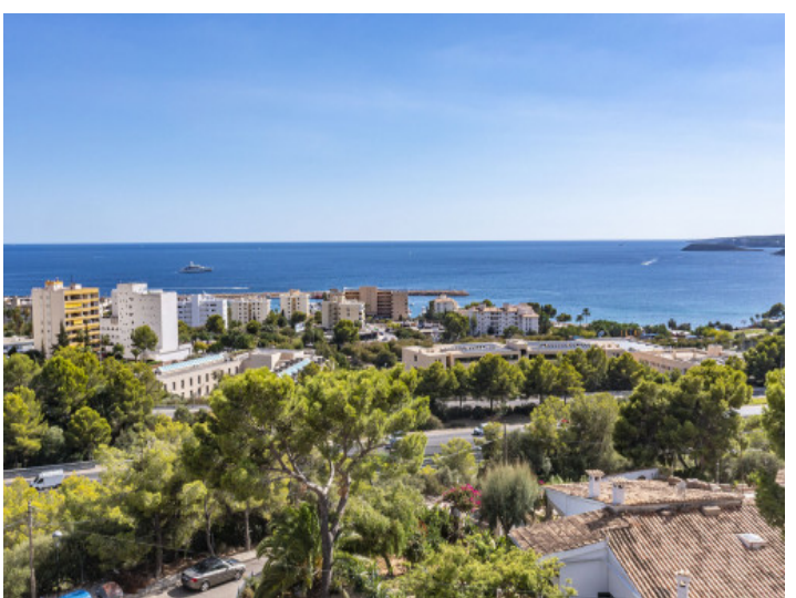
Fantastic sea views