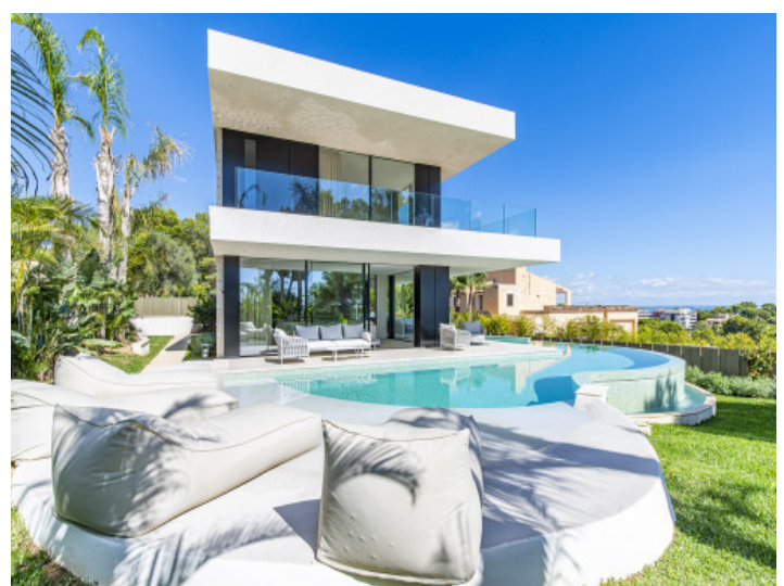
Modern pool area with terrace