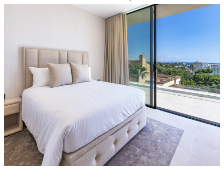
Bedroom with balcony access