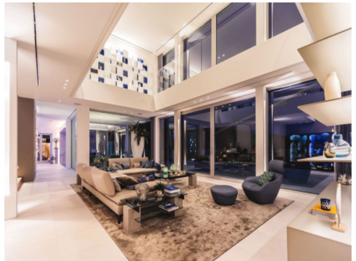
Living area by night