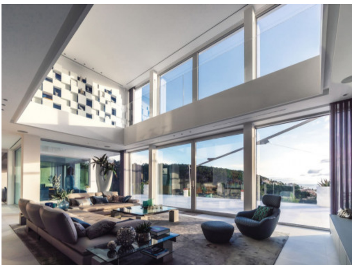
Fantastic views from the living area