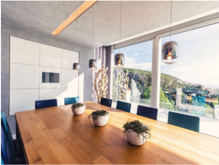
Fantastic dining area