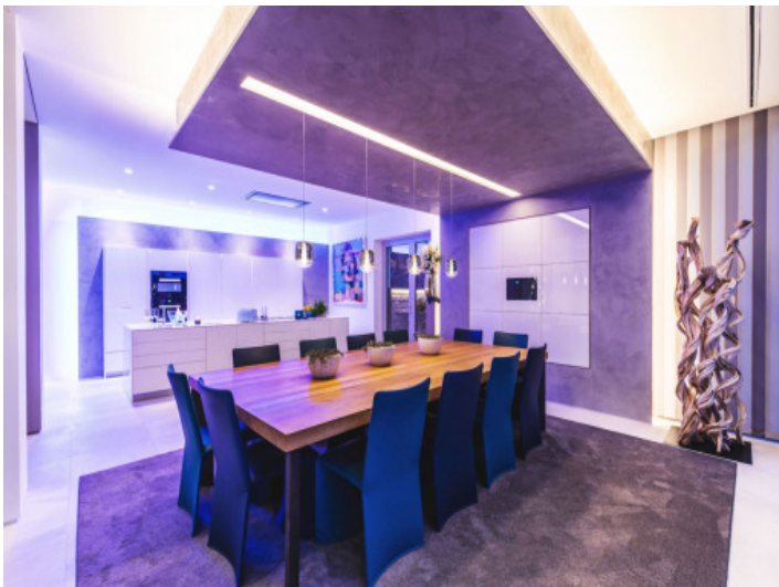
Dining area with American kitchen