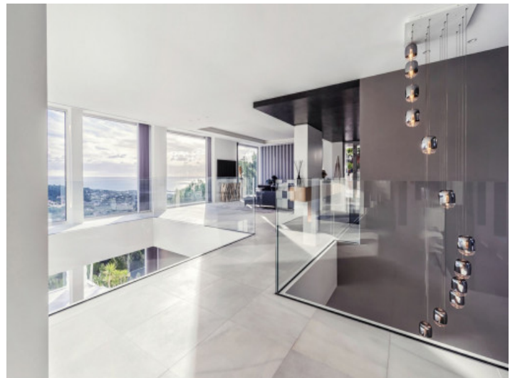
Gallery with sweeping views