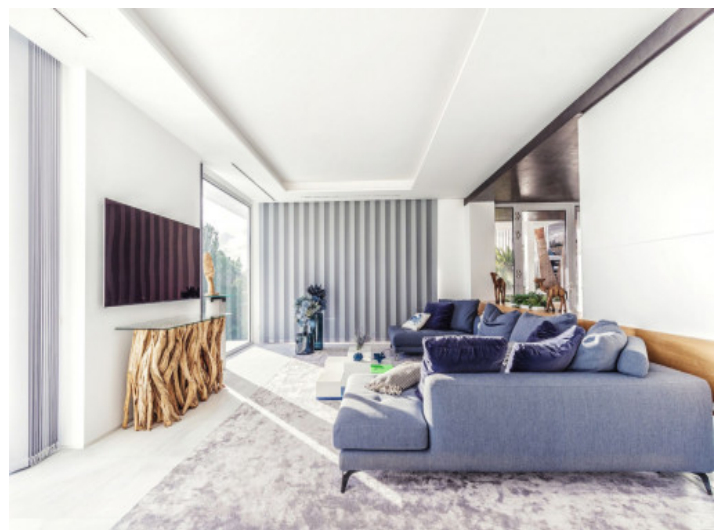
Additional living room

All information is correct to the best of our knowledge. Errors and prior sale excepted. This prospectus is purely for information purposes. Only the notarized deed of sale is legally binding.