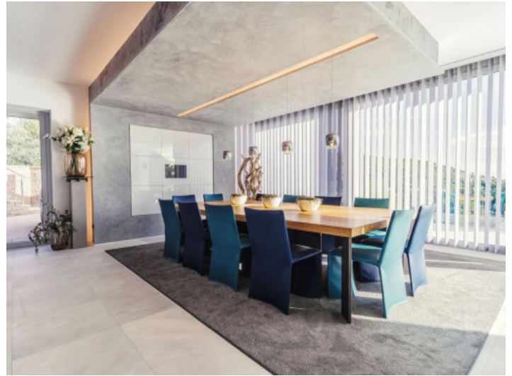
Elegant dining area