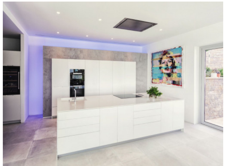
Modern kitchen with island