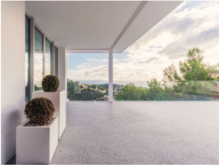
Large covered terrace