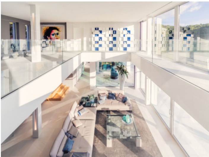
Luxurious living area with high ceilings