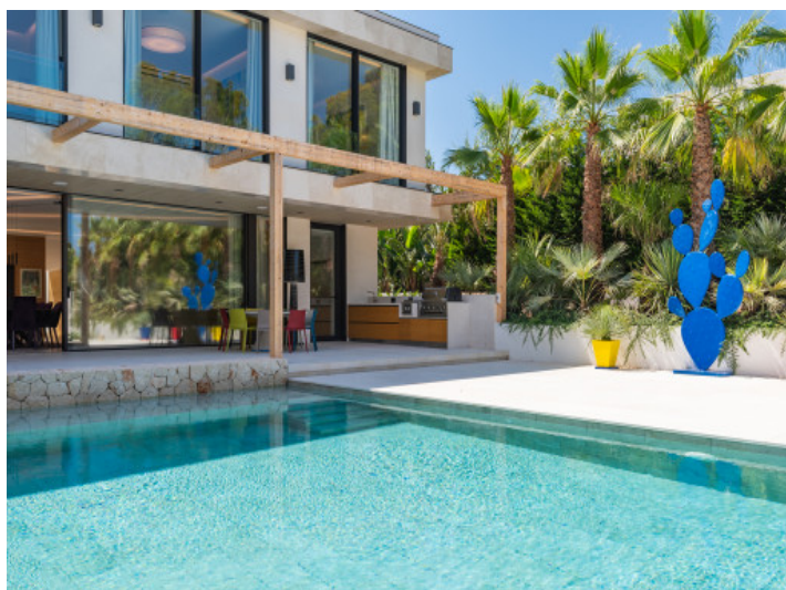
Great pool area