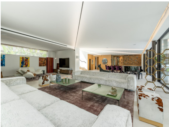
Modern living area