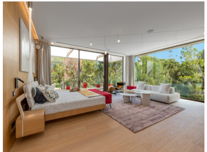
The bedroom has floor-to-ceiling windows