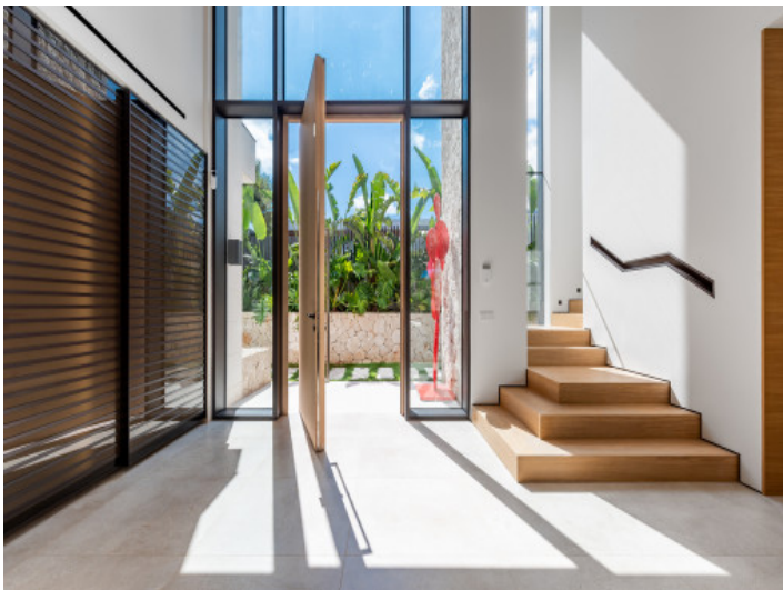
Bright entrance area