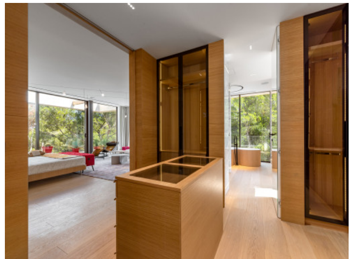
Access to the walk-in wardrobe from the main bedroom

All information is correct to the best of our knowledge. Errors and prior sale excepted. This prospectus is purely for information purposes. Only the notarized deed of sale is legally binding.