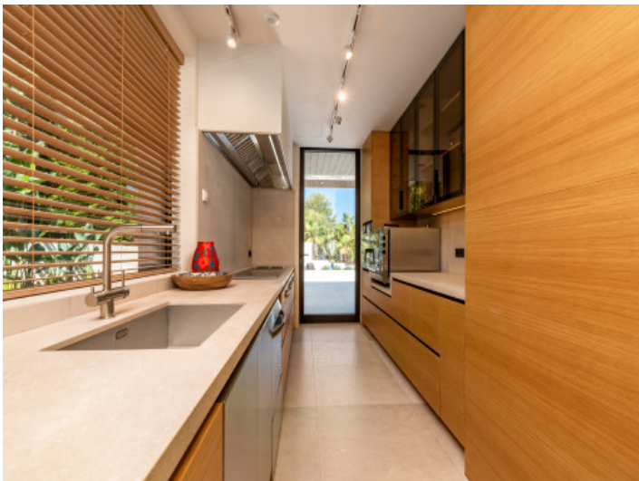
The kitchen invites all for dining