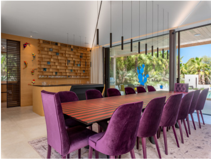
Dining area with direct terrace access