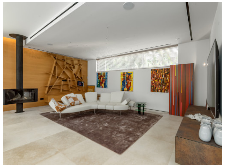
Living area with chimney

All information is correct to the best of our knowledge. Errors and prior sale excepted. This prospectus is purely for information purposes. Only the notarized deed of sale is legally binding.