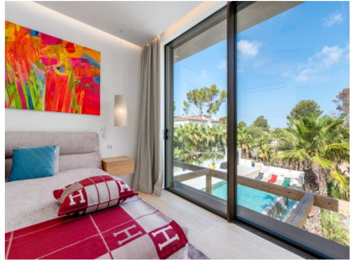
An other bedroom