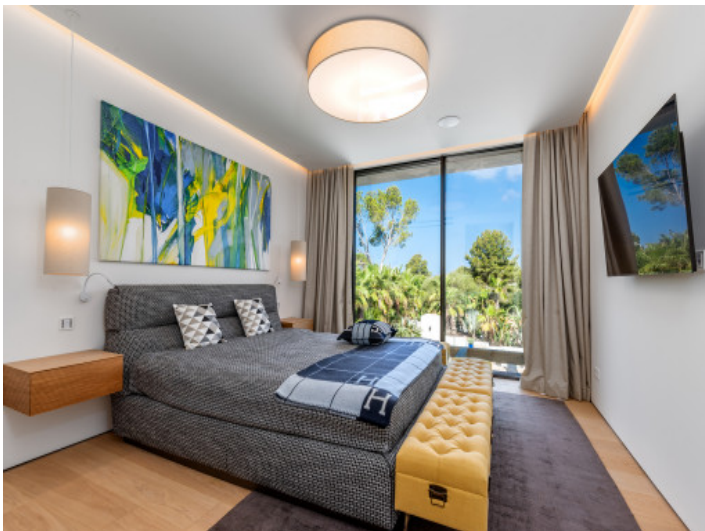
Bedroom with glance in the distance