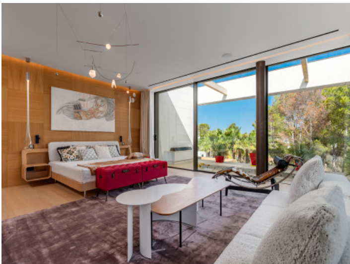
Direct balcony access from the bedroom