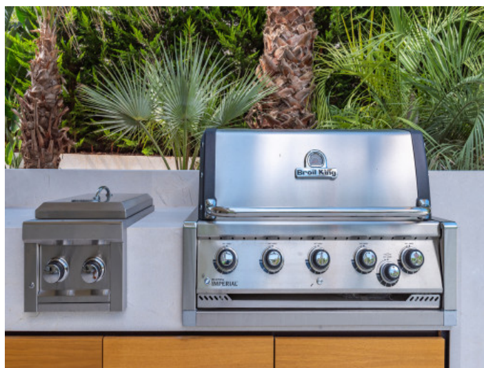
Outdoor kitchen with barbecue area