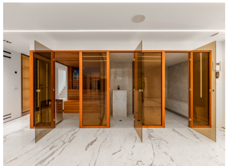
Sauna area from the villa

All information is correct to the best of our knowledge. Errors and prior sale excepted. This prospectus is purely for information purposes. Only the notarized deed of sale is legally binding.