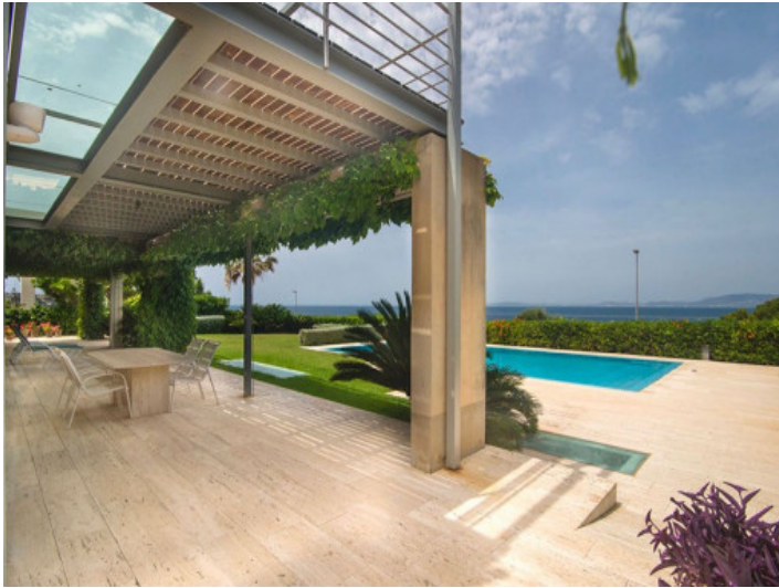
Spacious covered terrace