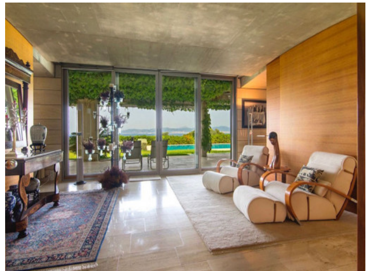
Fabulous living area with sea views