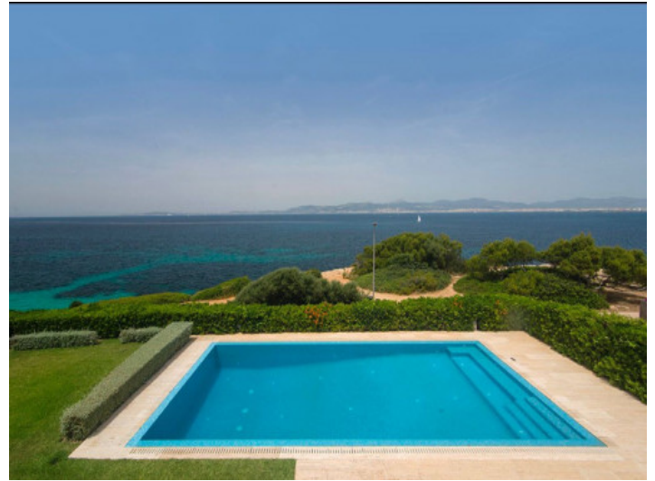
Pool area with sea views