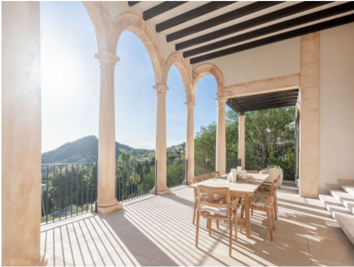
Covered terrace with a view

All information is correct to the best of our knowledge. Errors and prior sale excepted. This prospectus is purely for information purposes. Only the notarized deed of sale is legally binding.