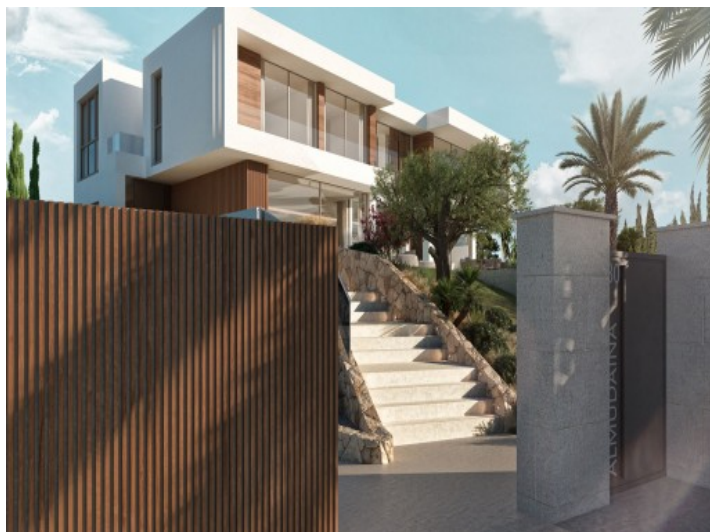
Access to the villa

All information is correct to the best of our knowledge. Errors and prior sale excepted. This prospectus is purely for information purposes. Only the notarized deed of sale is legally binding.