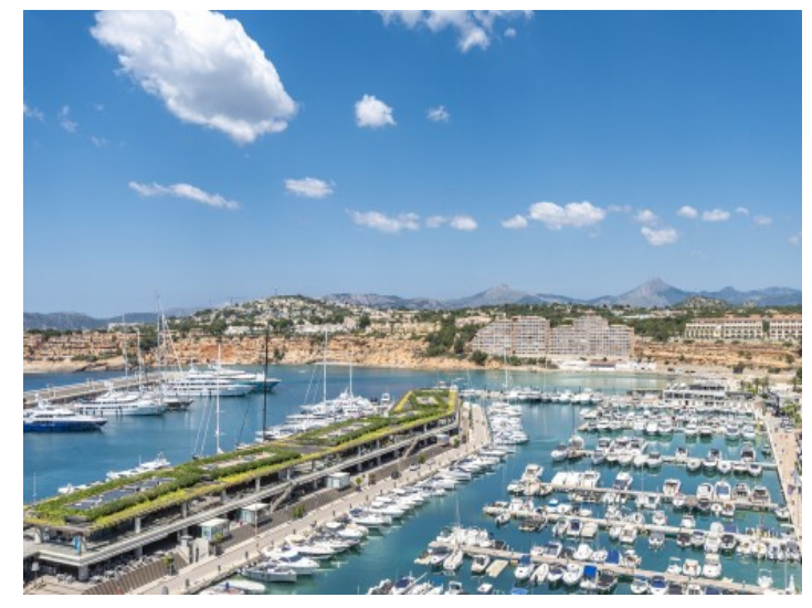
Spectacular views over Port Adriano