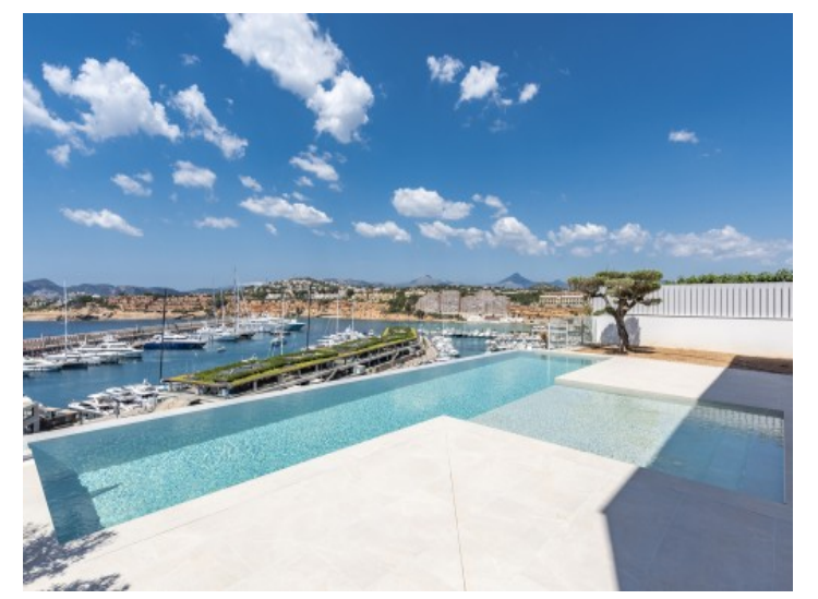
Pool area in a unqiue location