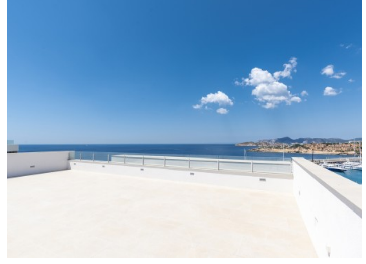
Large sea view roof terrace