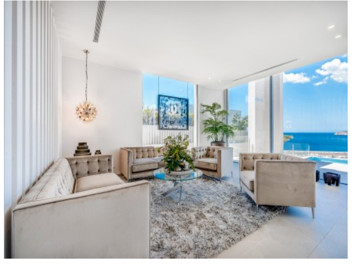
Stylish living area with sea views