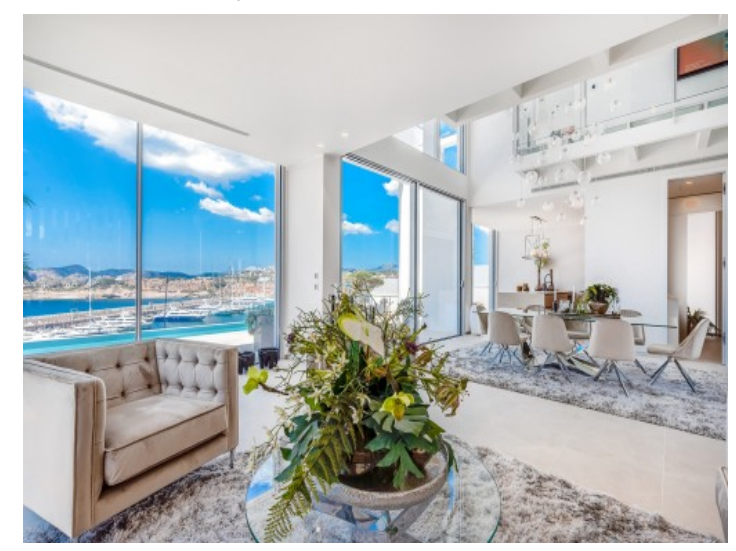
Living area with panorama sea views

All information is correct to the best of our knowledge. Errors and prior sale excepted. This prospectus is purely for information purposes. Only the notarized deed of sale is legally binding.