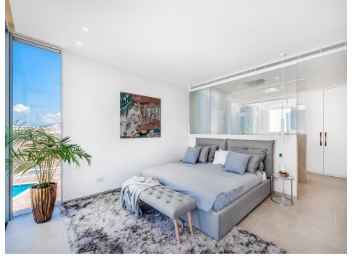
Bedroom with en suite bathroom