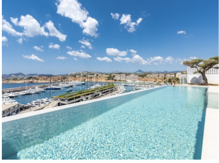
Infinity pool with stunning harbour views