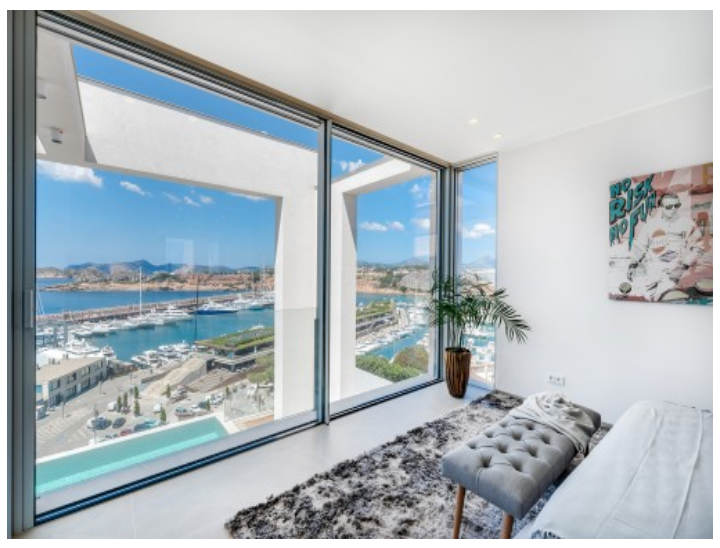
Bedroom with dreamlike sea views