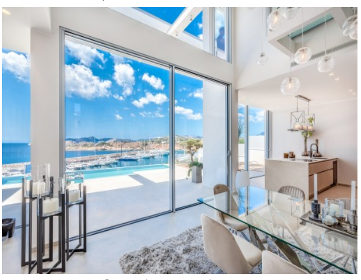
Spectacular access to the terrace