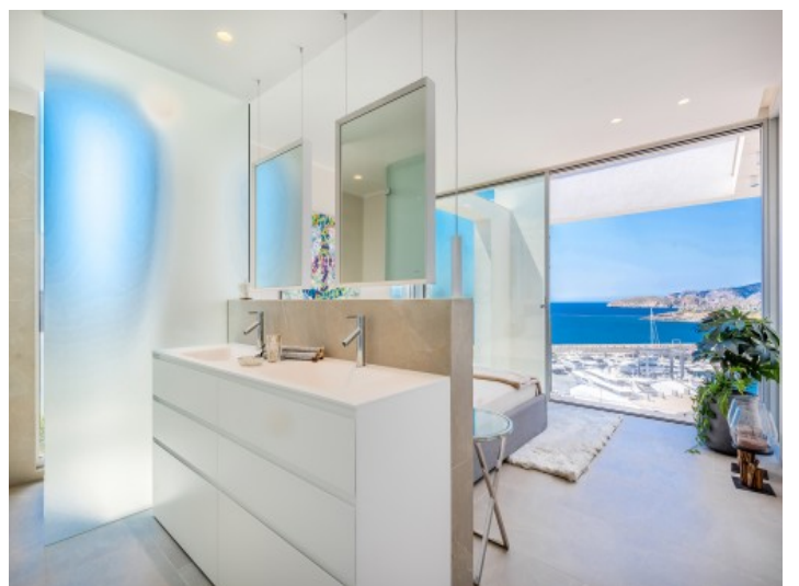
One of 4 bathrooms Large dressing area All information is correct to the best of our knowledge. Errors and prior sale excepted. This prospectus is purely for information purposes. Only the notarized deed of sale is legally binding.