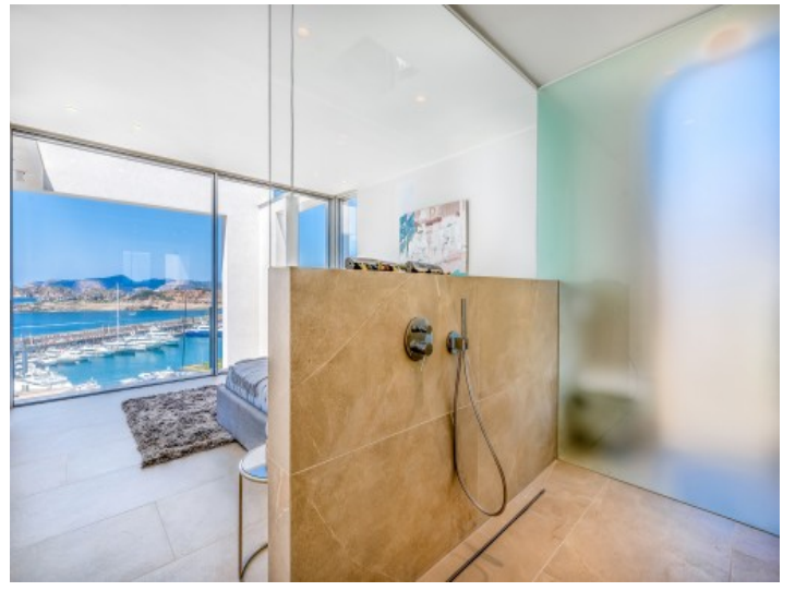
Noble en suite bathroom