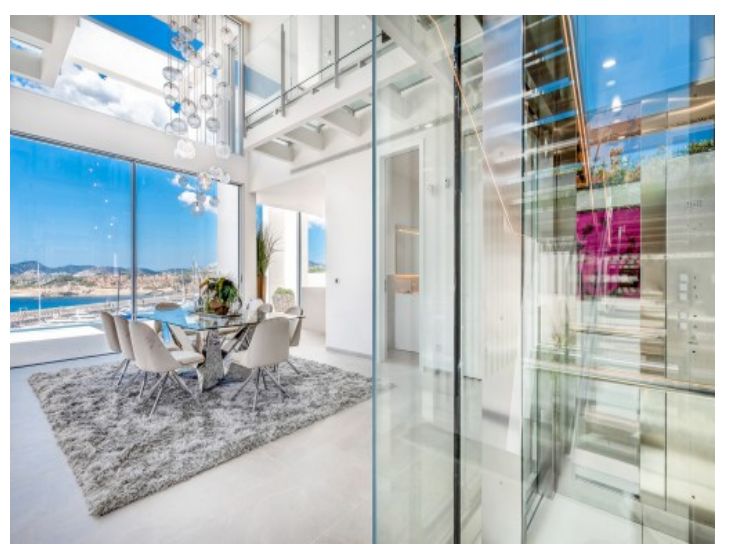
Dining area and elevator