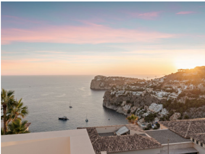
Unique mediterranean sea views