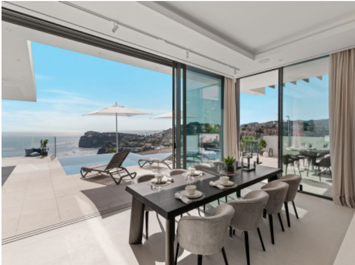
Dining area with balcony access