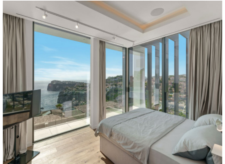
Bedroom with floor-to-ceiling windows