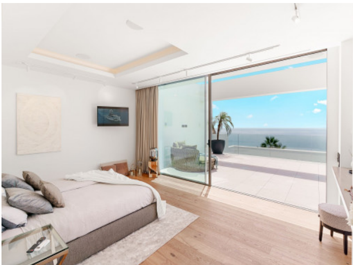
Bedroom with balcony