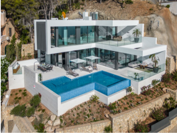
Modern designer villa