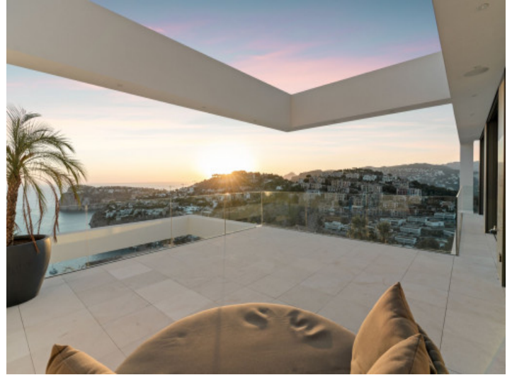
Modern designer villa close to the Cala Llamp