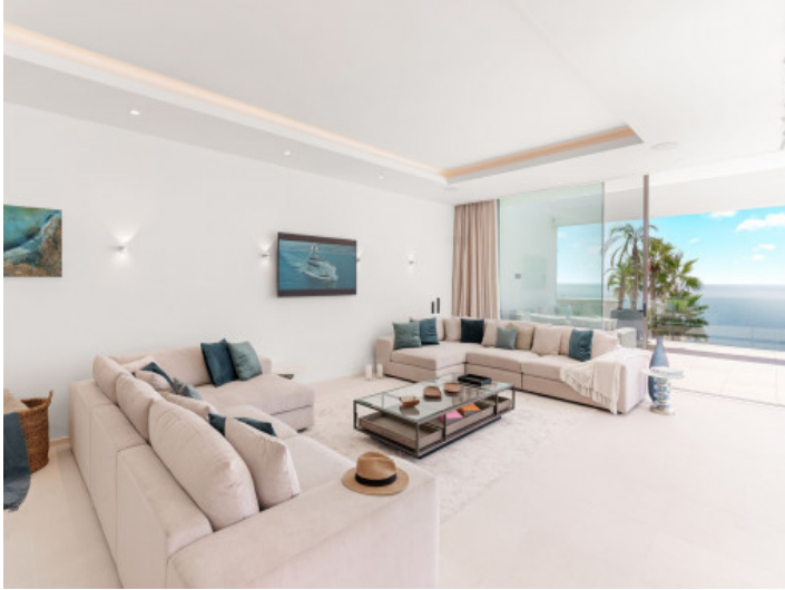
Luxury living area