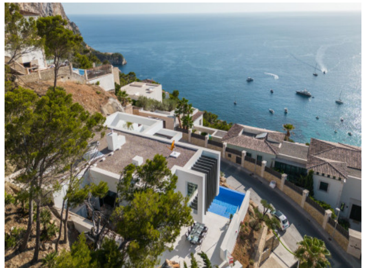
Bird's eye views to the villa and the sea