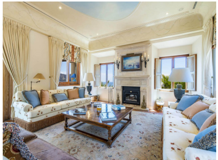
Light flooded living area