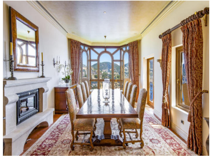
Inviting dining area