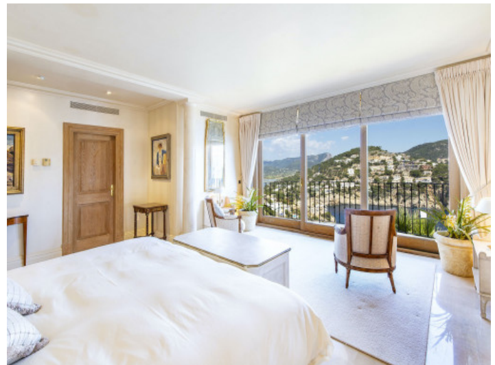
Master bedroom with panoramic view