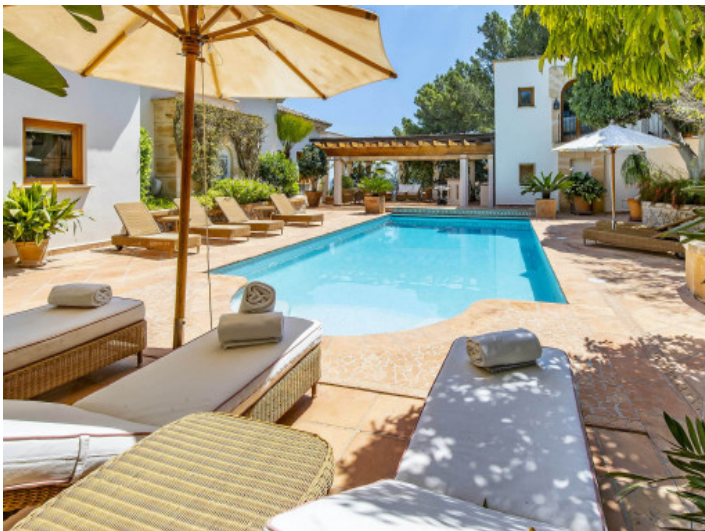
Sun loungers by the pool