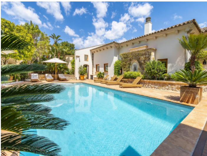
Exterior view of the villa