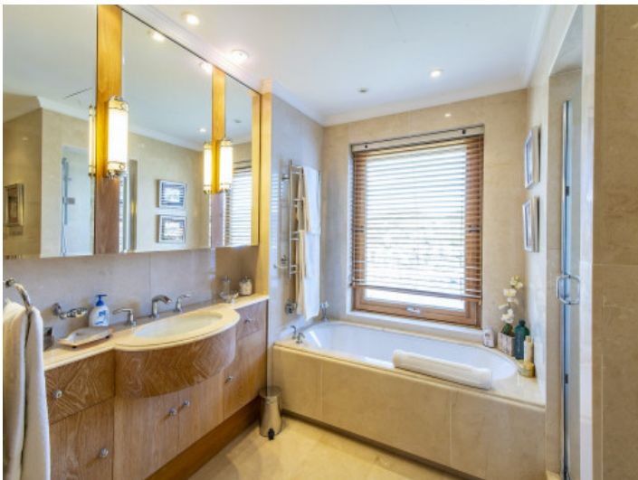
Bathroom en suite with bath tub