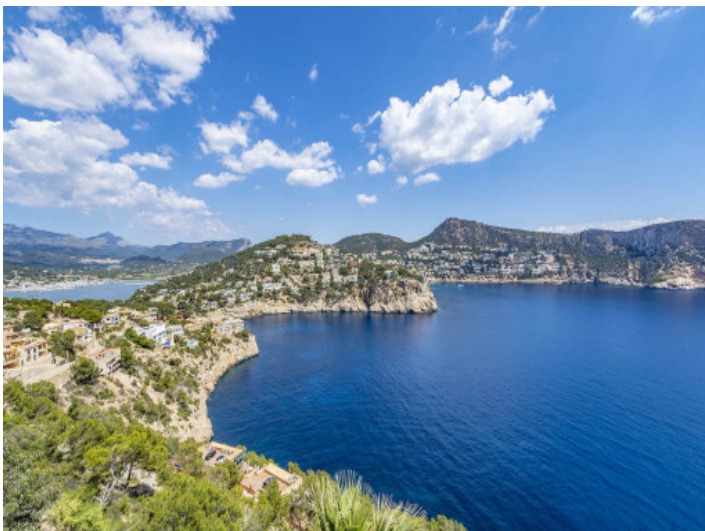
View of La Mola