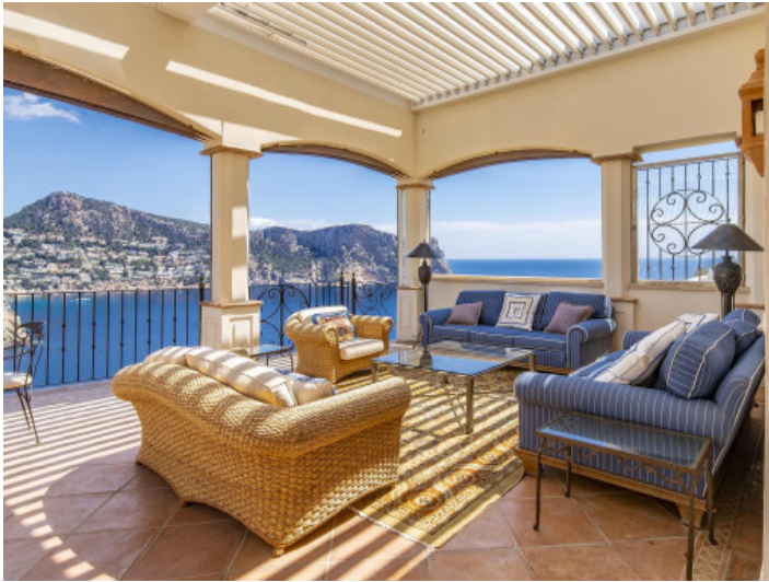
Wonderful sea view terrace