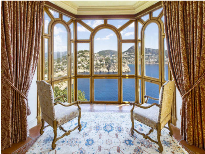
Impressive view from the dining area