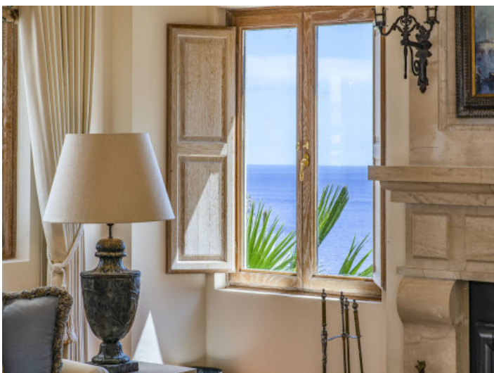
View to the sea