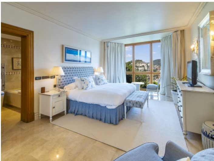
Second double bedroom with bathroom en suite