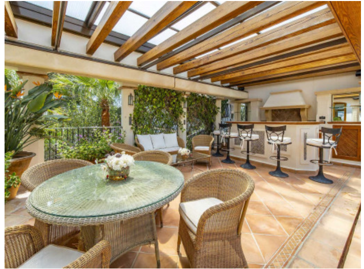
Spacious barbecue and dining area on the terrace