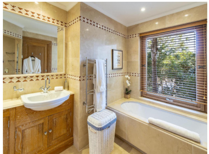
Fantastic bathroom en suite

All information is correct to the best of our knowledge. Errors and prior sale excepted. This prospectus is purely for information purposes. Only the notarized deed of sale is legally binding.