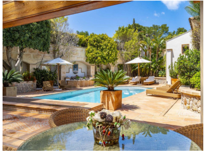
Sunny pool area