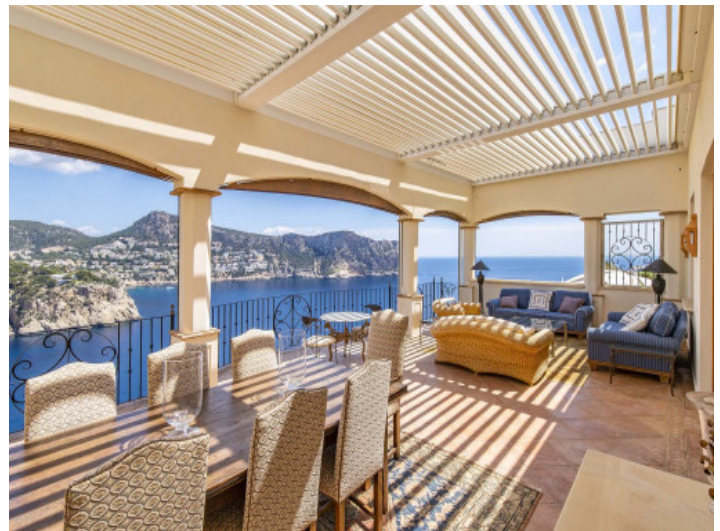
Large dining area on the terrace