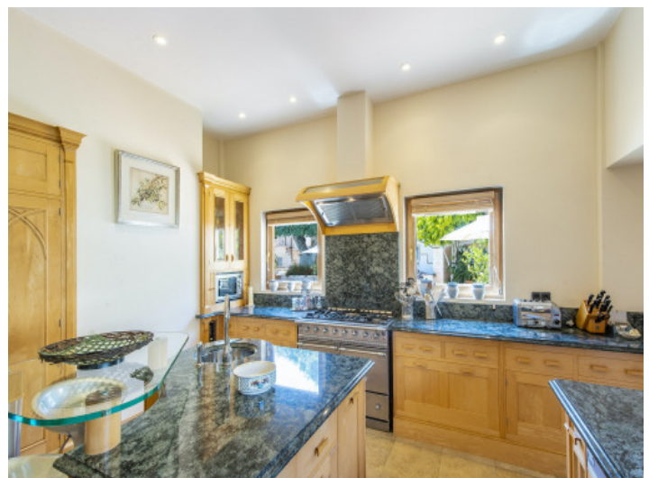
Fully equipped kitchen with cooking island

All information is correct to the best of our knowledge. Errors and prior sale excepted. This prospectus is purely for information purposes. Only the notarized deed of sale is legally binding.