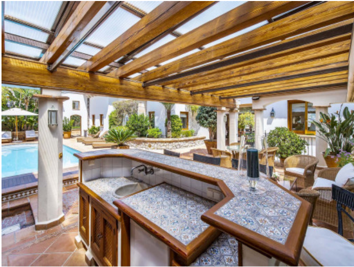
Spacious barbecue and dining area on the terrace