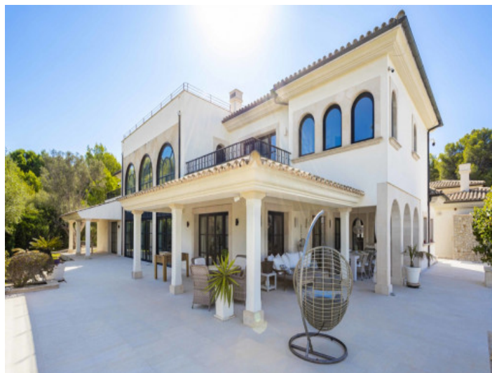
Covered terrace with lounge area