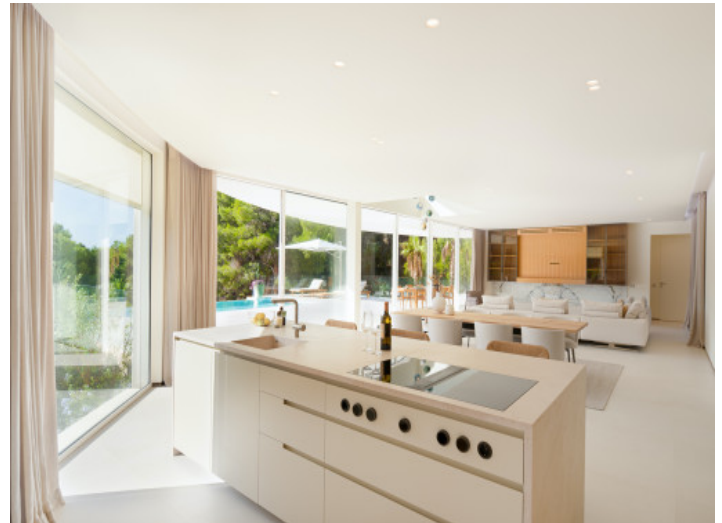
Open living area