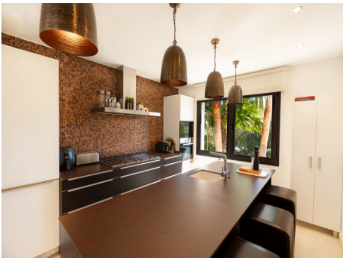
Kitchen with bar