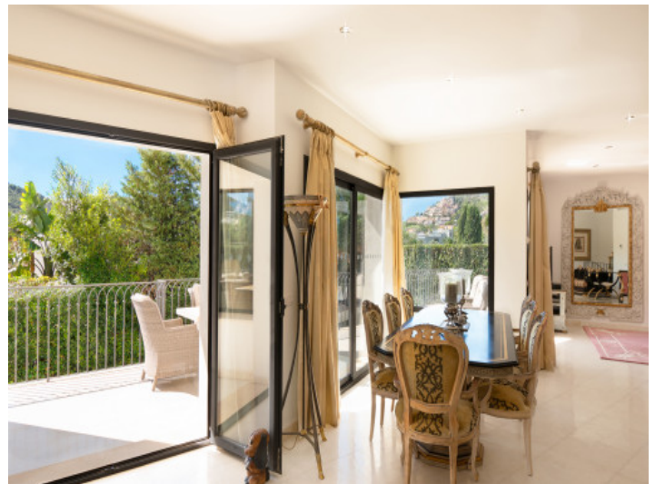
Dining area with balcony access