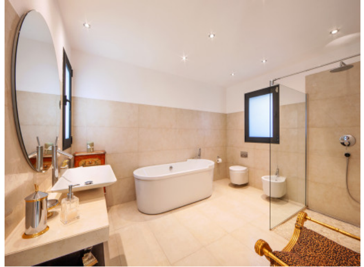
Bathroom with shower and bathtub