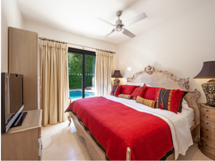
Bedroom with double bed and pool views