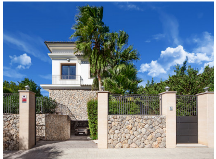
Views from the street to the villa