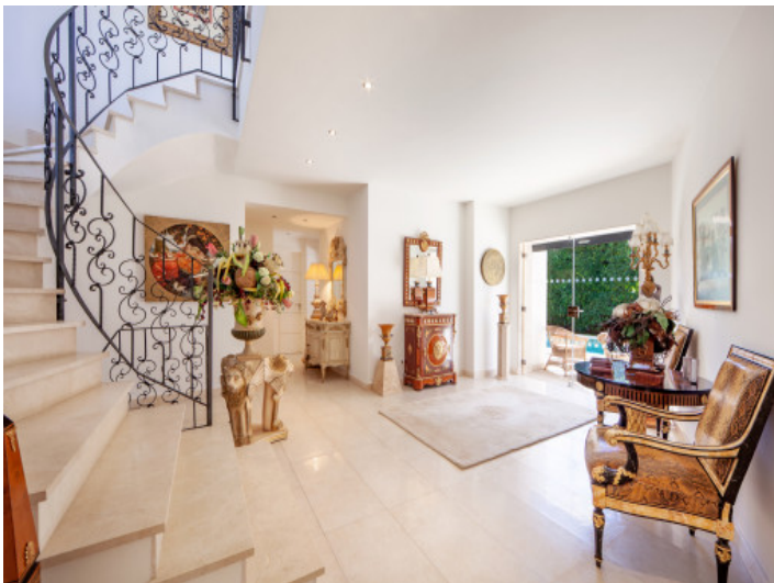
Entrance from the villa