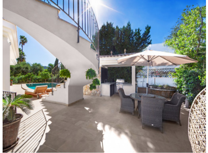
Gorgeous terrace with summer kitchen